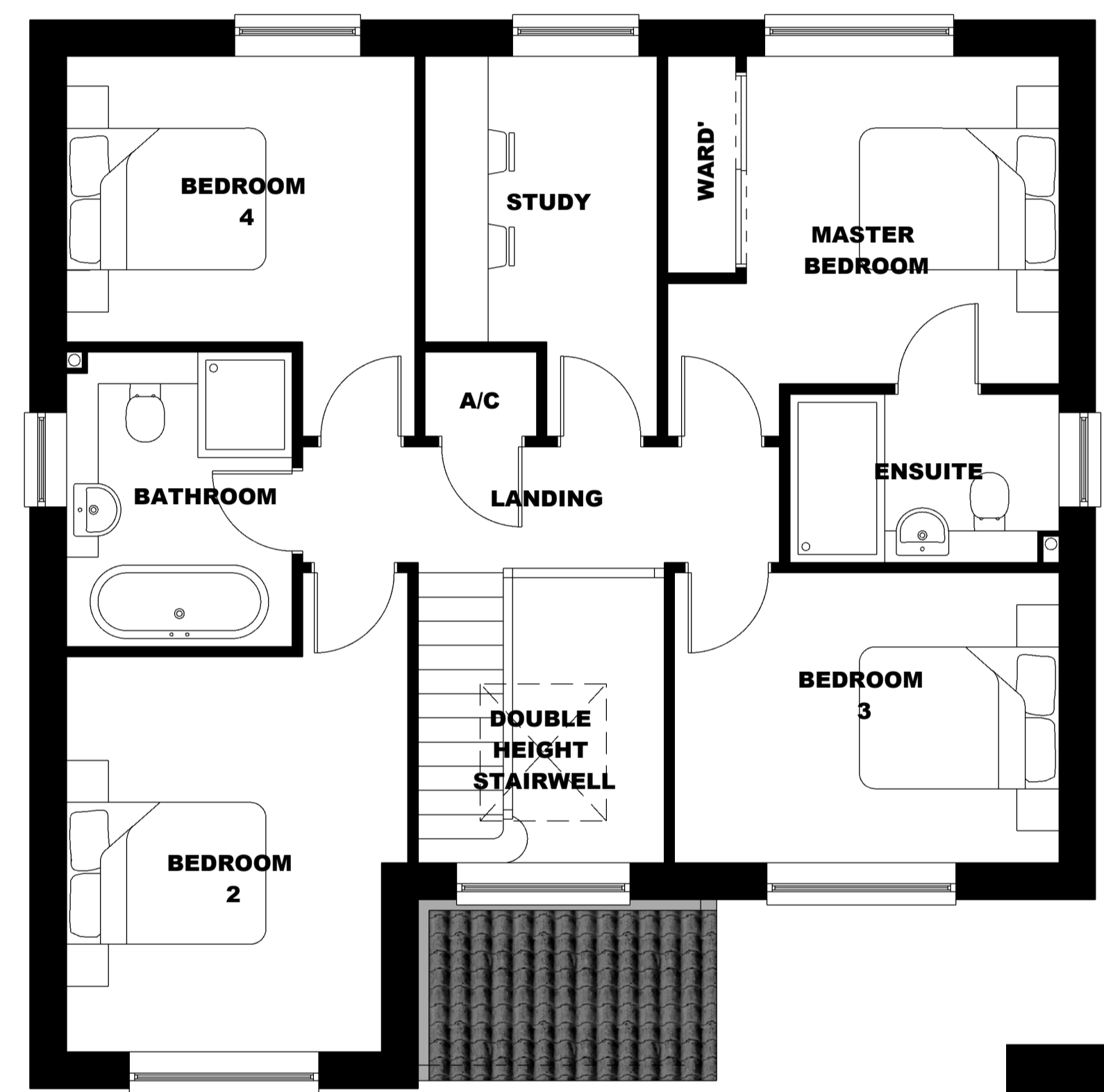
FIRST FLOOR PLAN Scale 1:50