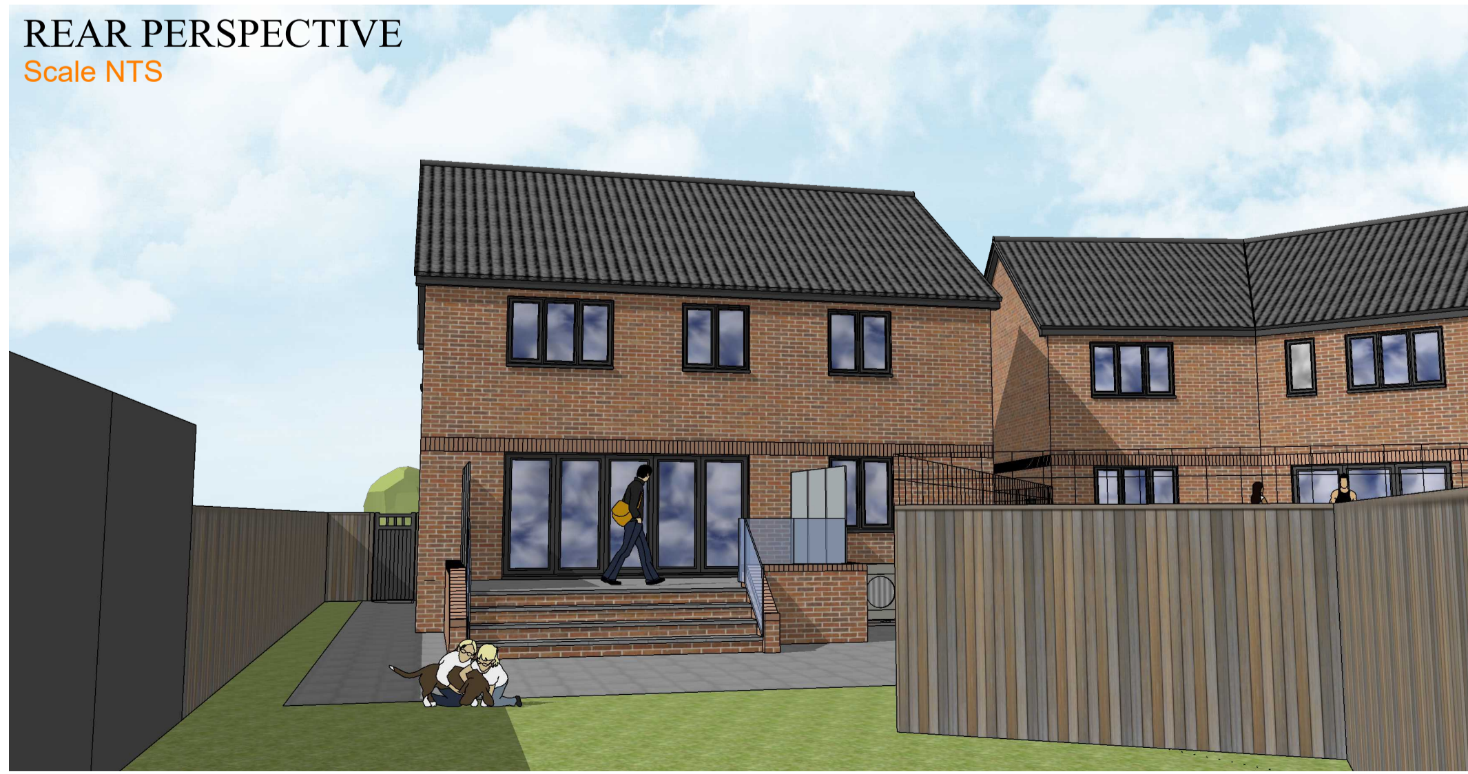
REAR PERSPECTIVE Scale NTS