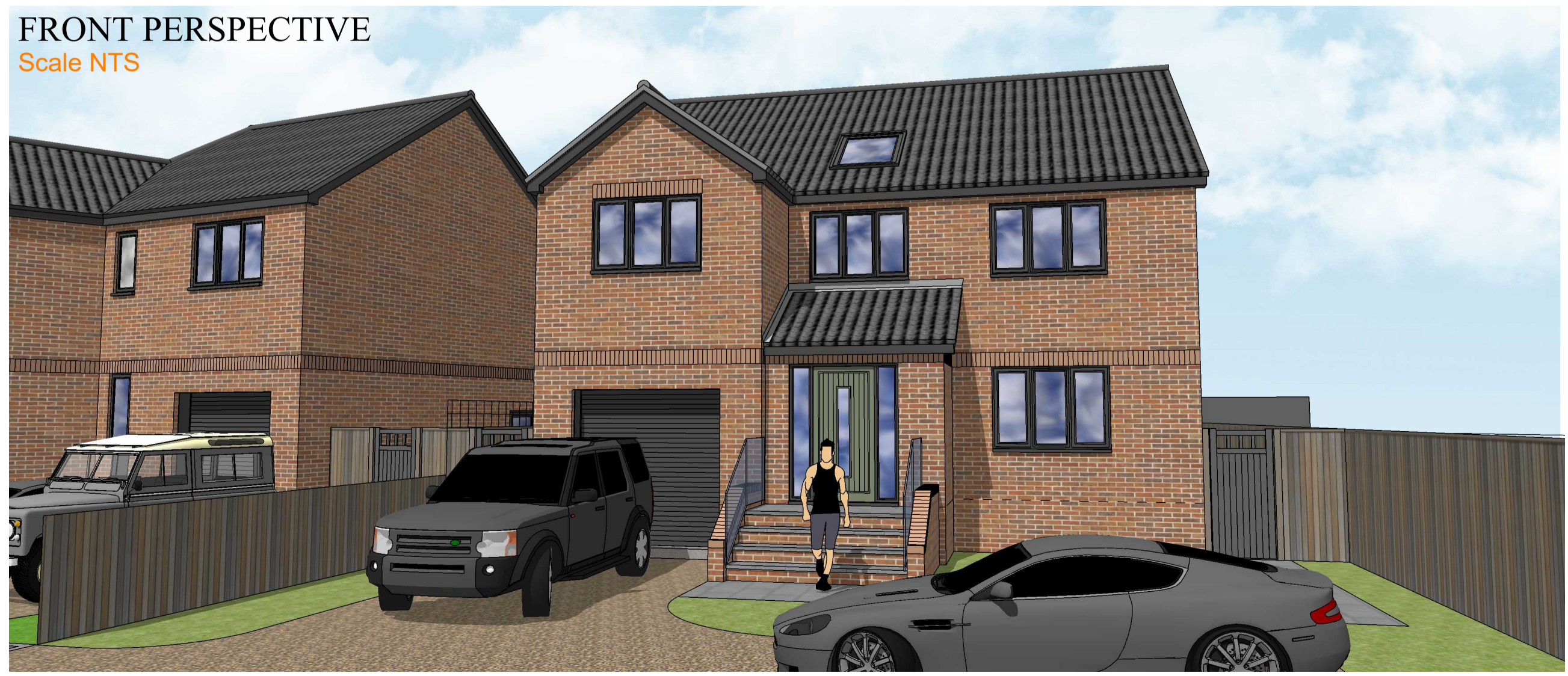
FRONT PERSPECTIVE Scale NTS