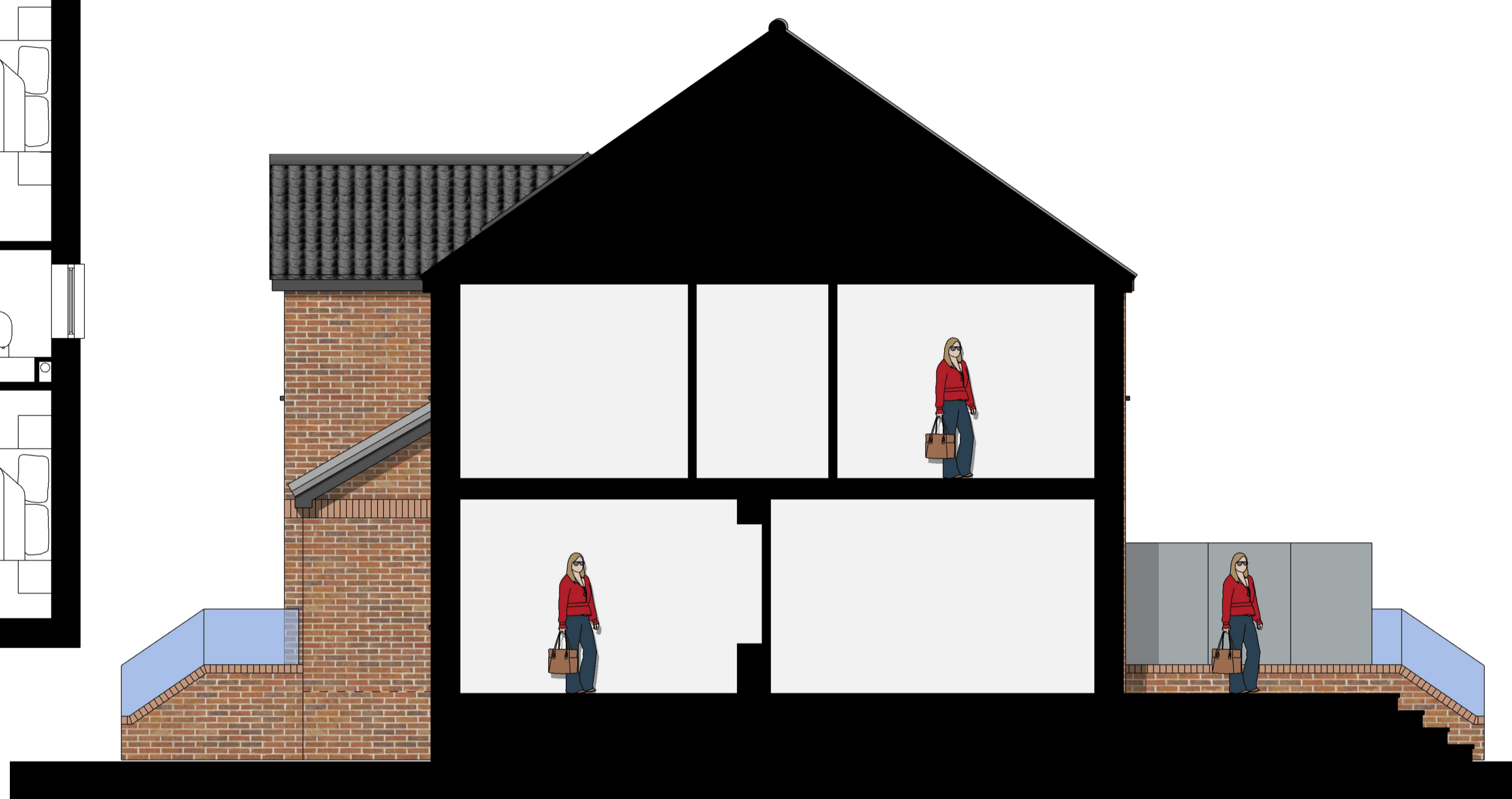
TYPICAL SECTION THRO' Scale 1:50