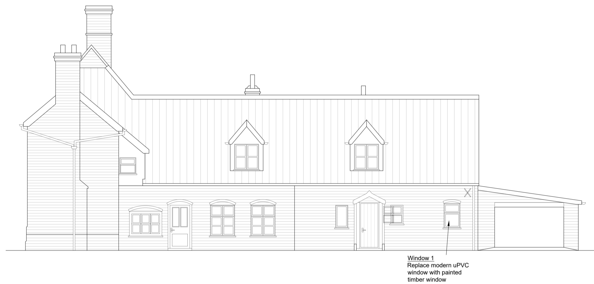
Proposed West Elevation @ 1:100