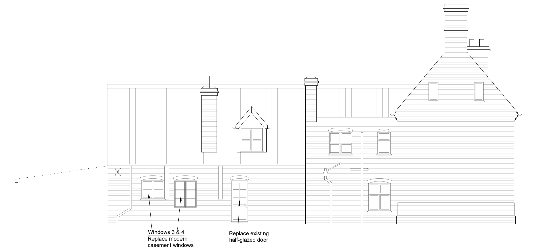
Proposed East Elevation @ 1:100

DO NOT SCALE DIMENSIONS FROM THIS DRAWING No works shall be carried out until this drawing has been approved by the Local Authority All setting out dimensions relating to any existing structures are to be verified by the contractor on site. NOTE - DISCREPANCIES BETWEEN THIS DRAWING AND SITE CONDITIONS ARE TO BE REPORTED TO ADAM POWER ASSOCIATES IMMEDIATELY.