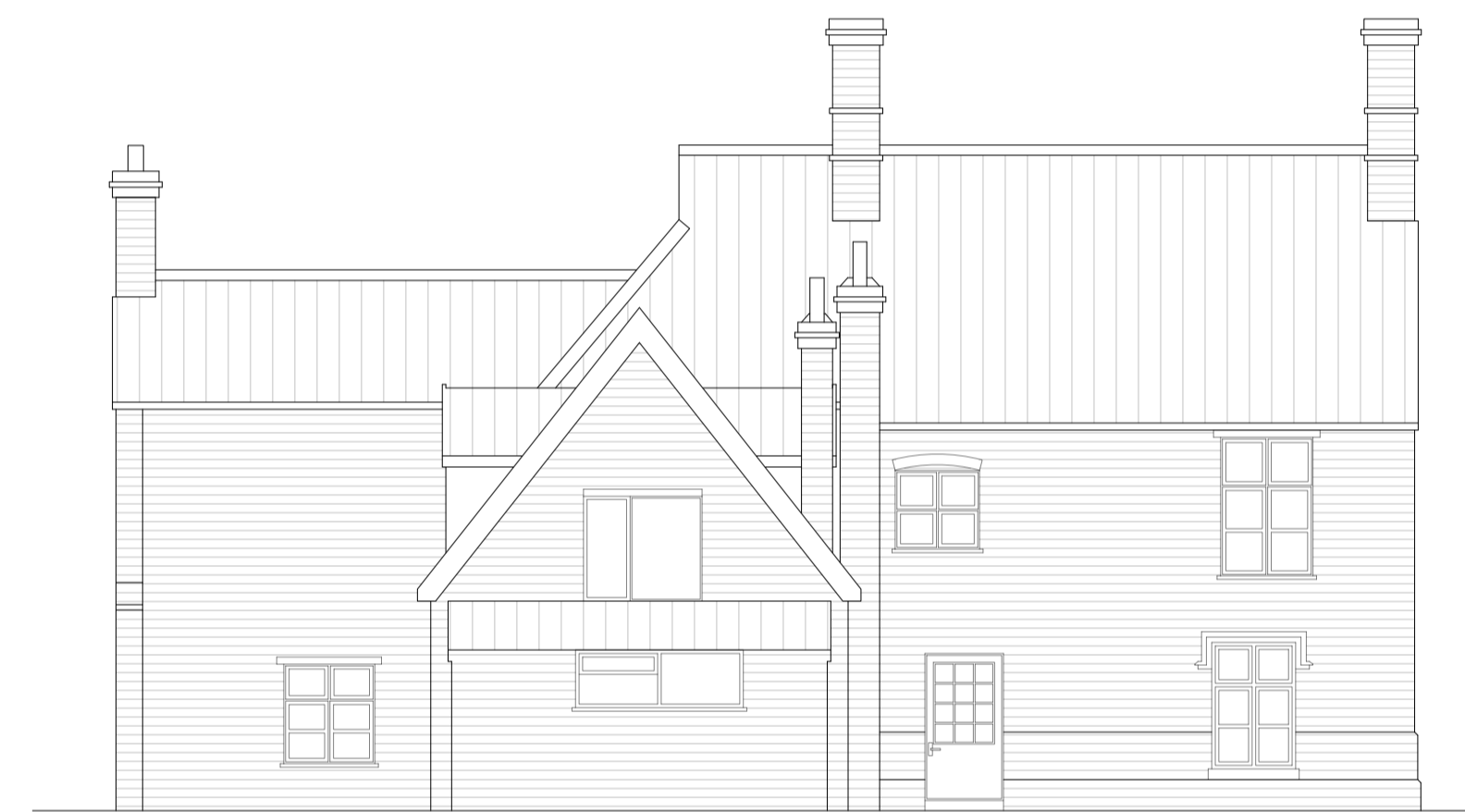
Proposed South Elevation @ 1:100