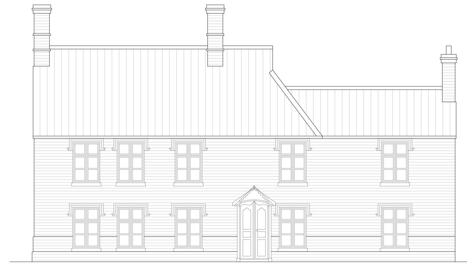
Proposed North Elevation @ 1:100