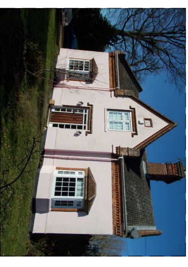
existing side elevation