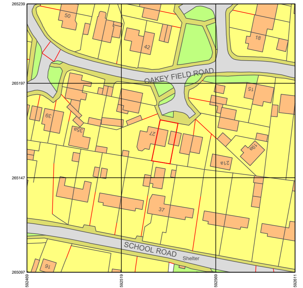
Location Plan @ 1 : 1250