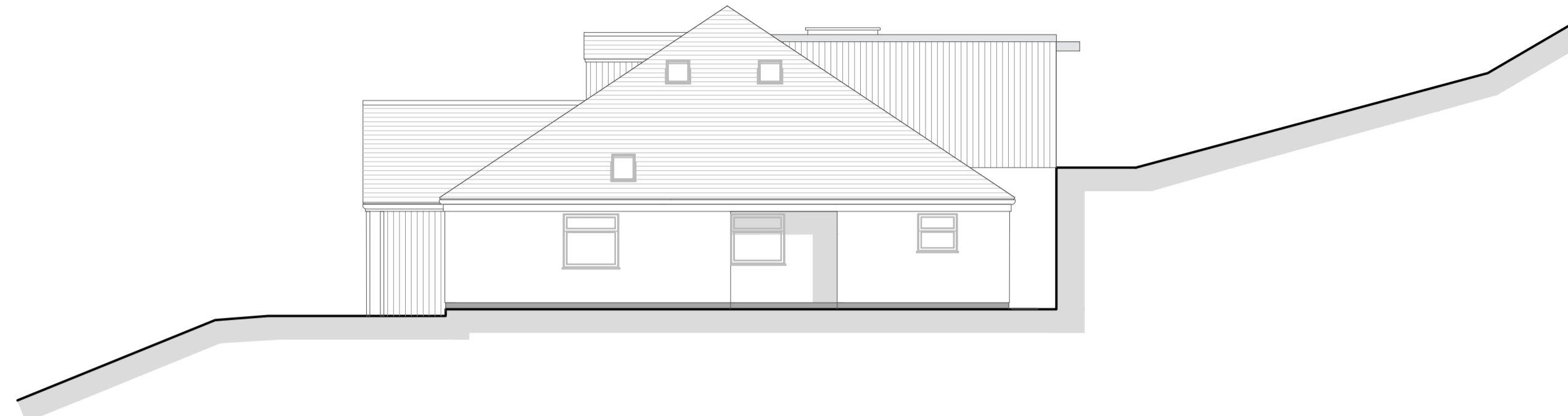
East 1:100 @ A1 0m 2m 4m