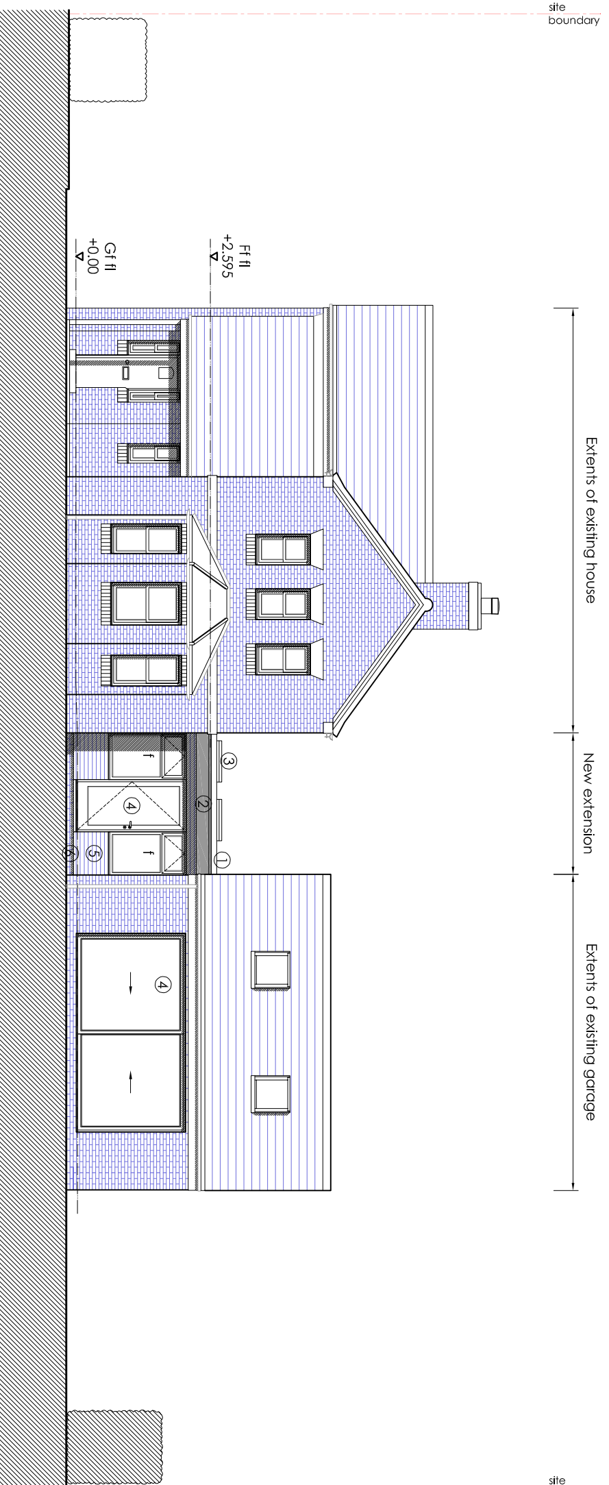
Proposed south elevation (side) Scale 1:100 @ A3