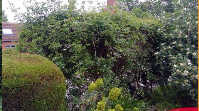
H1 - Hawthorn