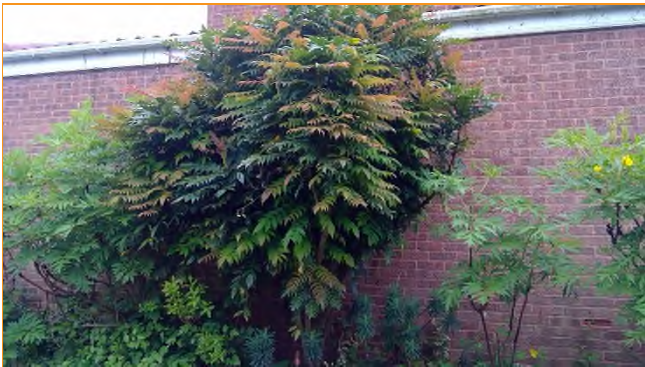
S2 - Mahonia