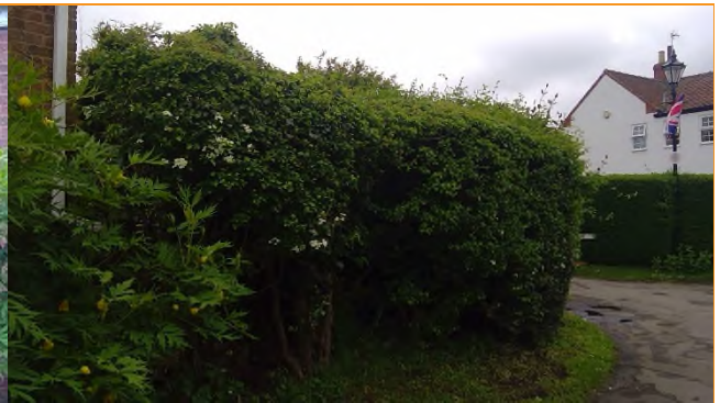
HG2 - Mixed species hedge