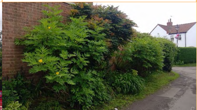
SG1 - Tree Peony