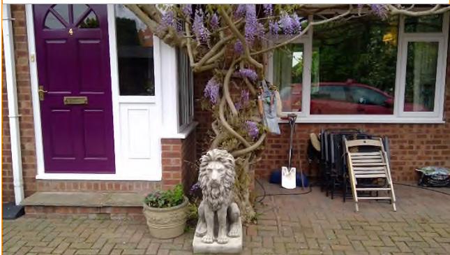
C1 - Wisteria