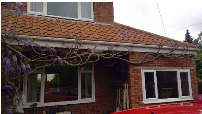
C1 - Wisteria