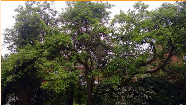
T1 - Plum