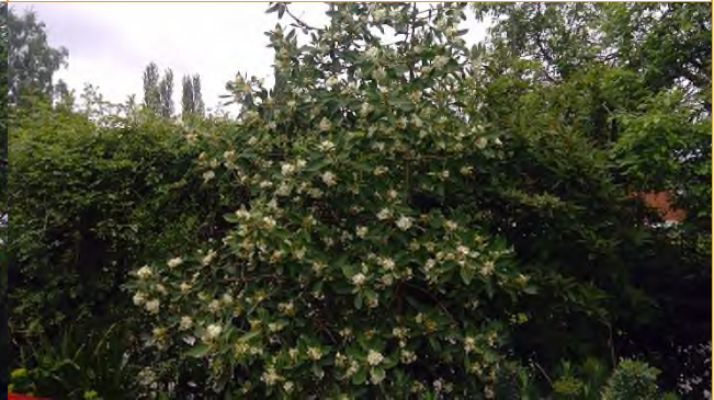
S1 - California laurel