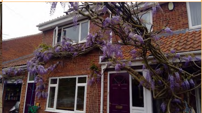
C1 - Wisteria