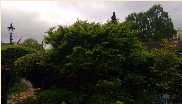
T2 - Cherry