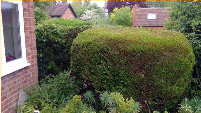
HG1 - Mixed species hedge