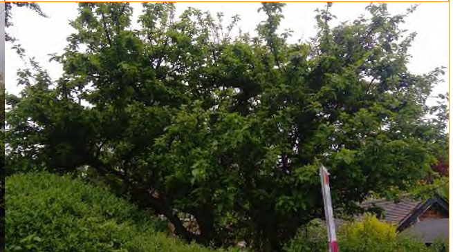
T3 - Apple