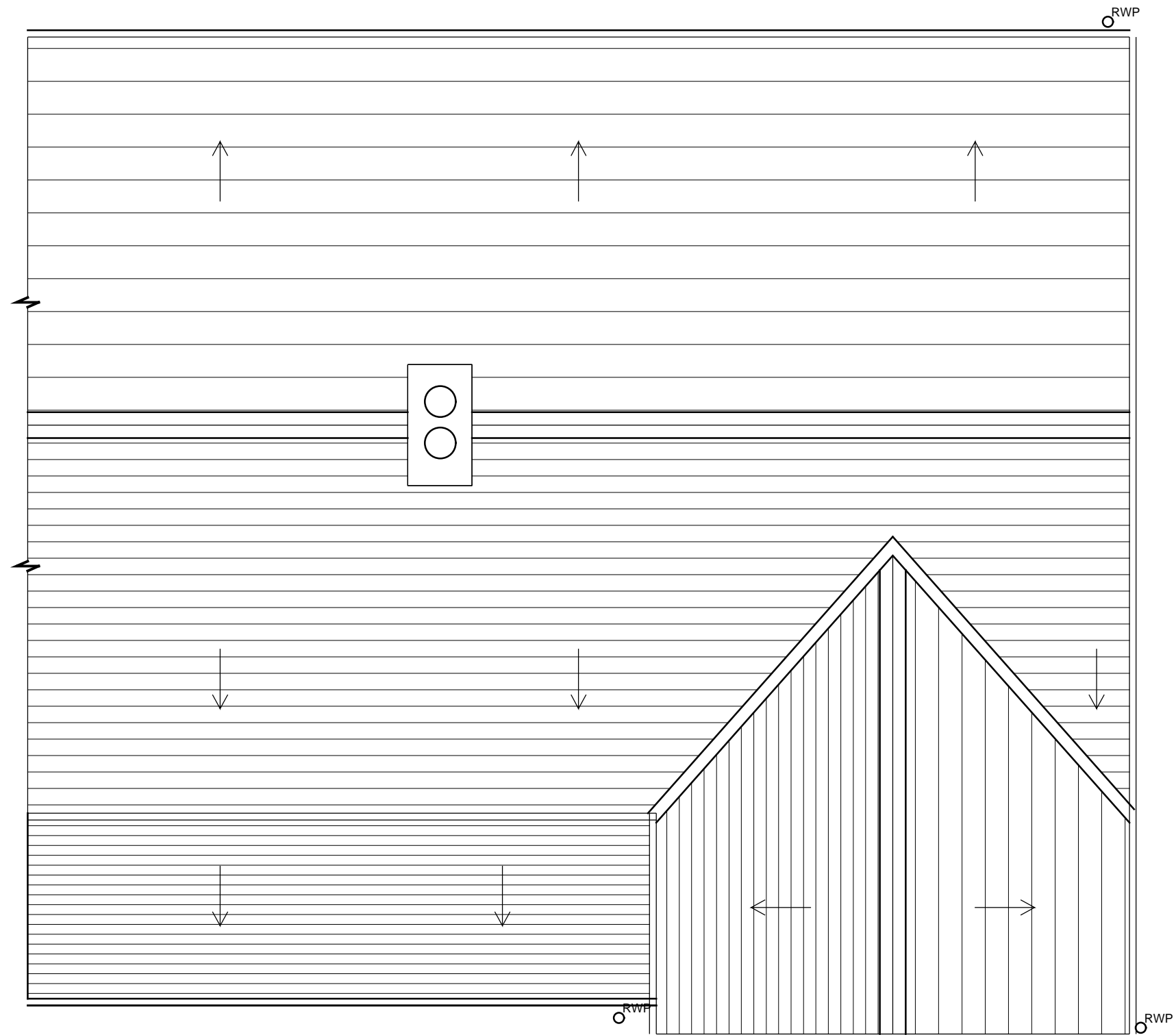
EXISTING ROOF PLAN