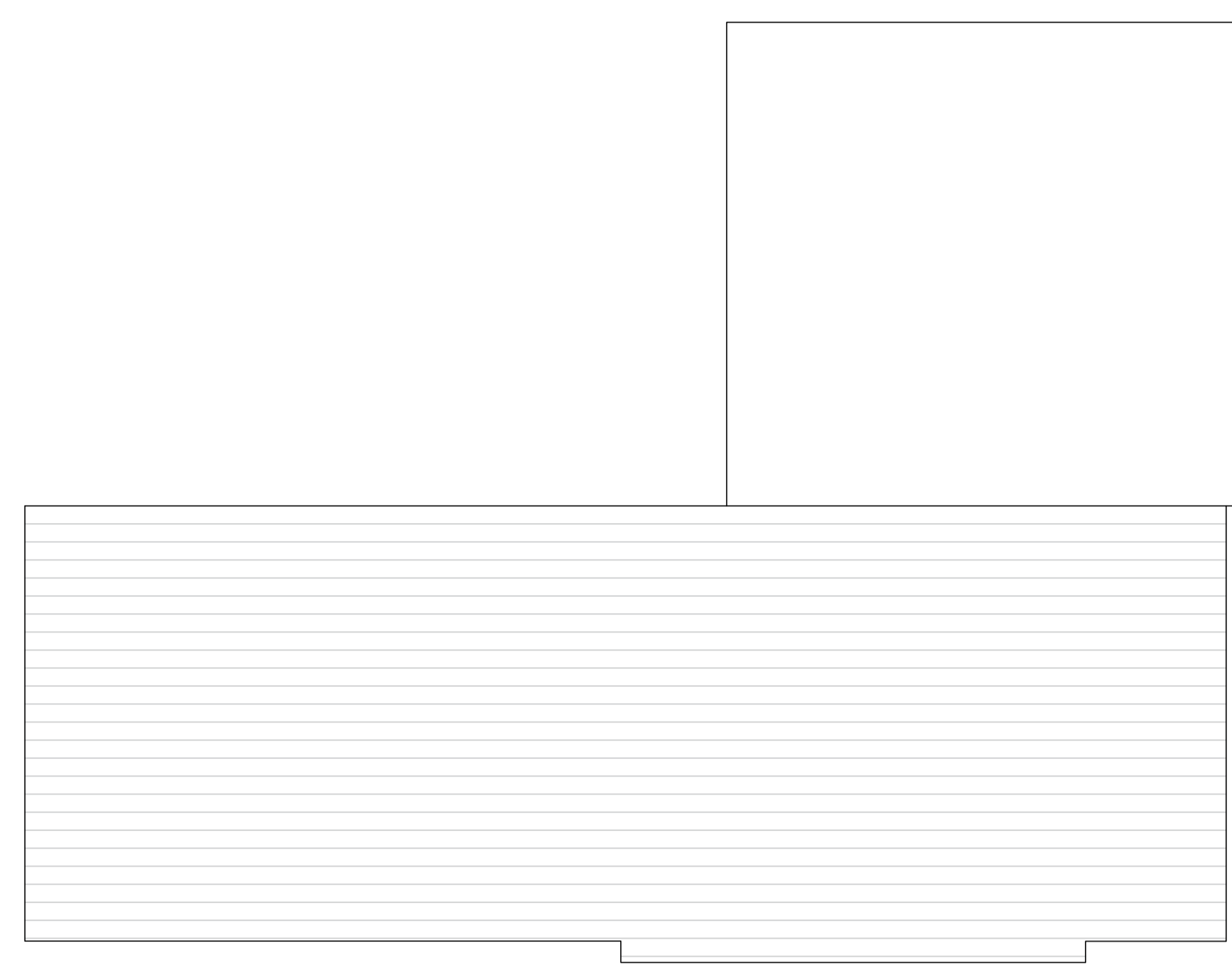
ROOF PLAN AS PROPOSED SCALE 1 : 50