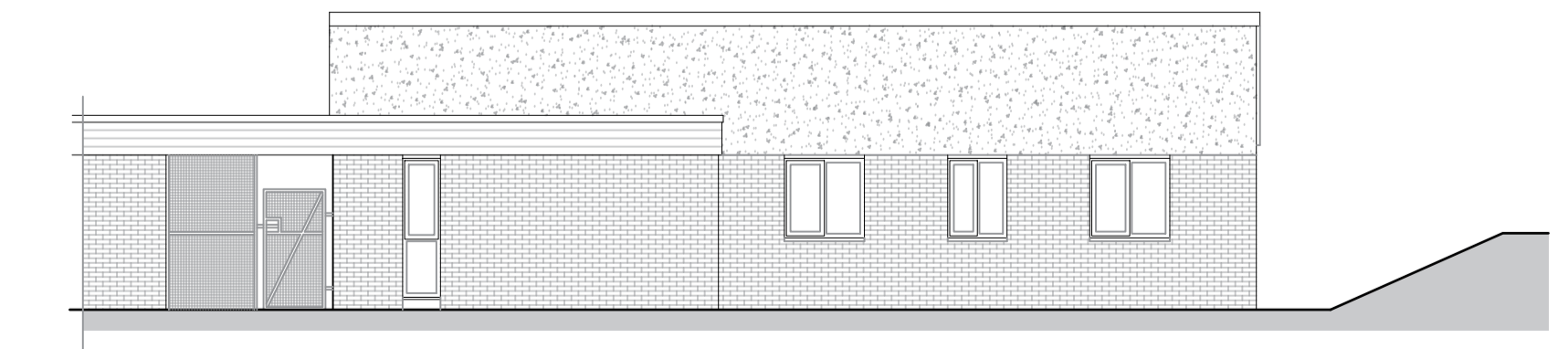
REAR ELEVATION (NORTH-WEST) AS PROPOSED SCALE 1 : 100