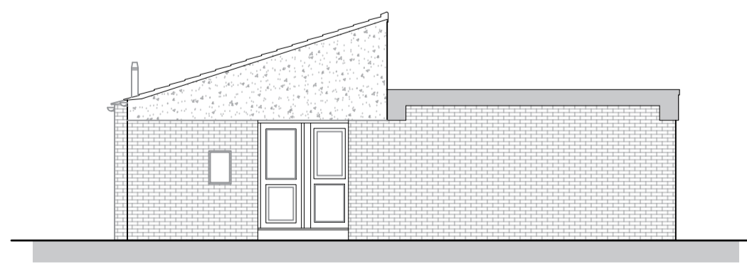
SIDE ELEVATION (NORTH-EAST) AS PROPOSED SCALE 1 : 100