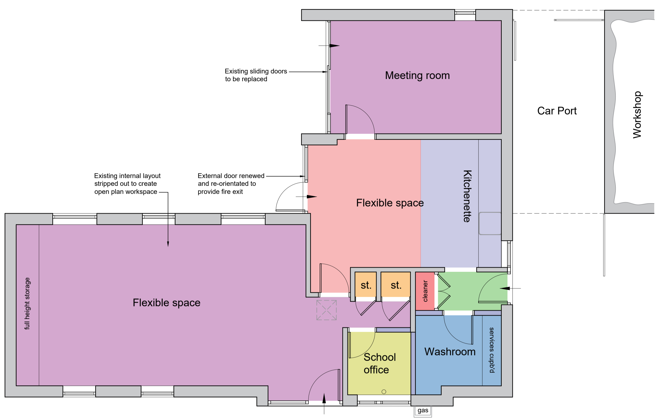
GROUND FLOOR LAYOUT AS PROPOSED SCALE 1 : 50