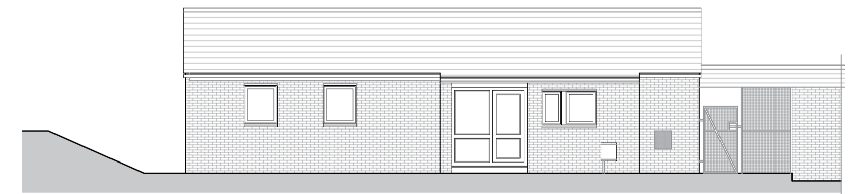
FRONT ELEVATION (SOUTH-EAST) AS PROPOSED SCALE 1 : 100