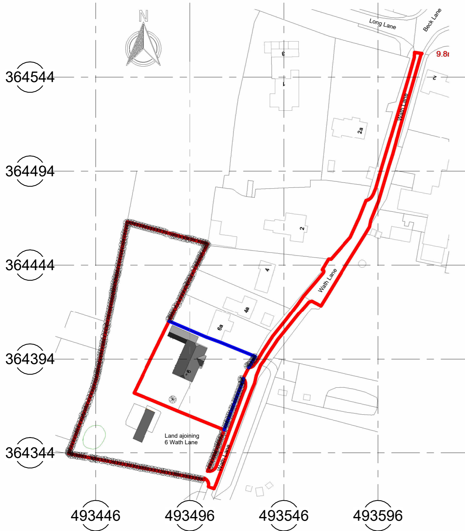
1.Existing Location Plan