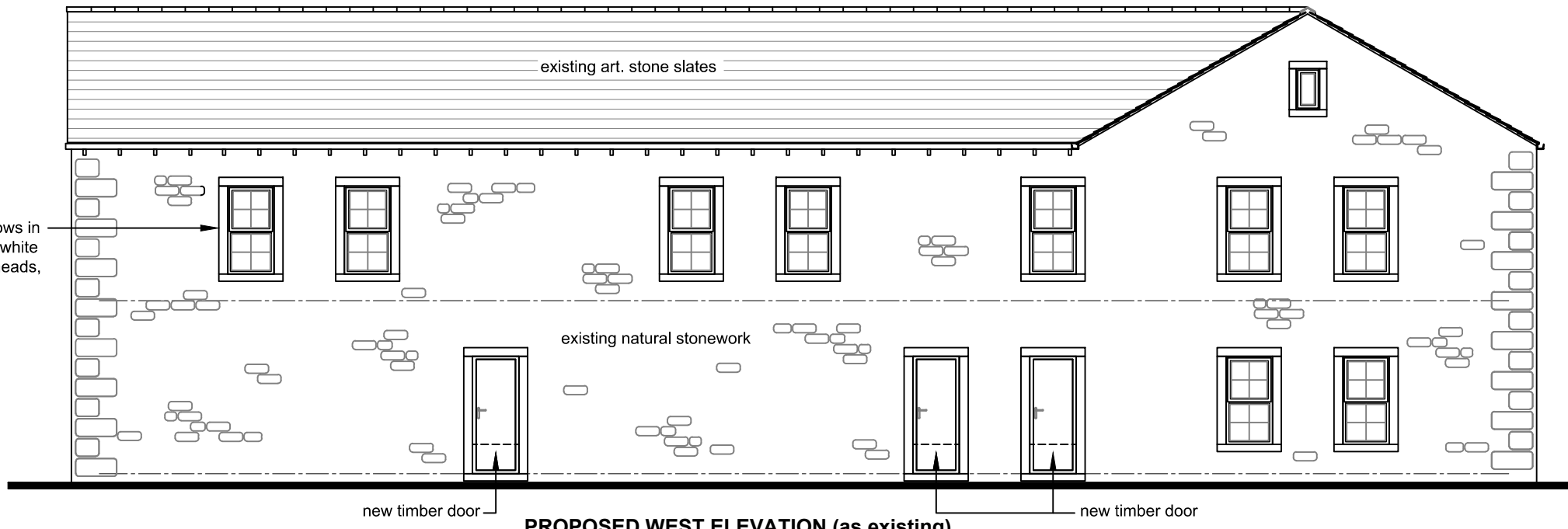
PROPOSED WEST ELEVATION (as existing)

existing sash windows in hard wood painted white and natural stone heads, cills, jambs