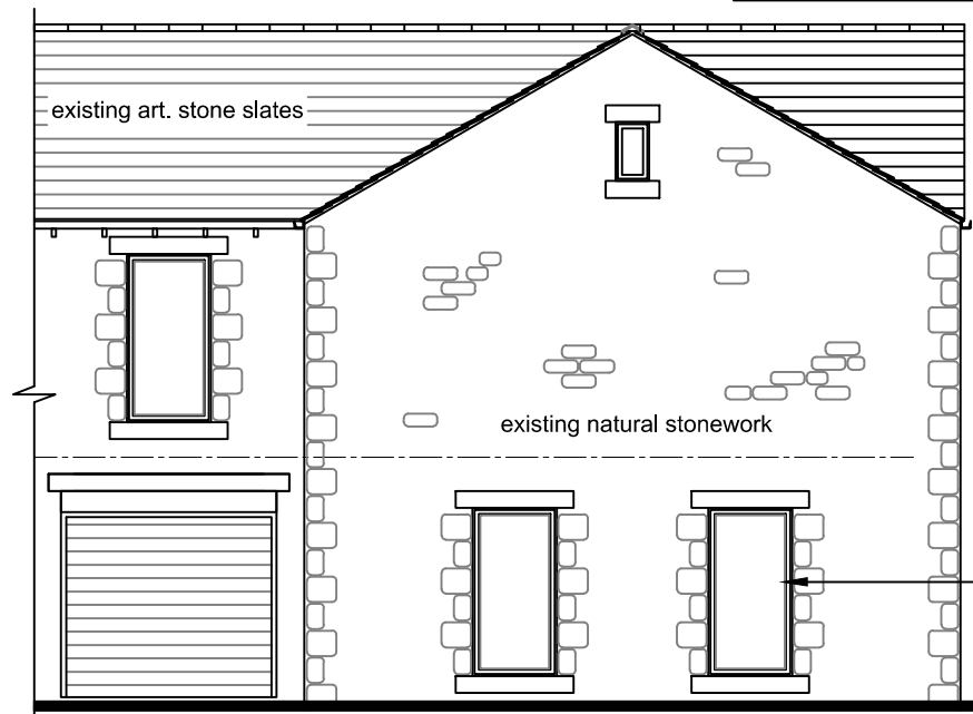
PROPOSED PARTIAL NORTH ELEVATION (as existing)