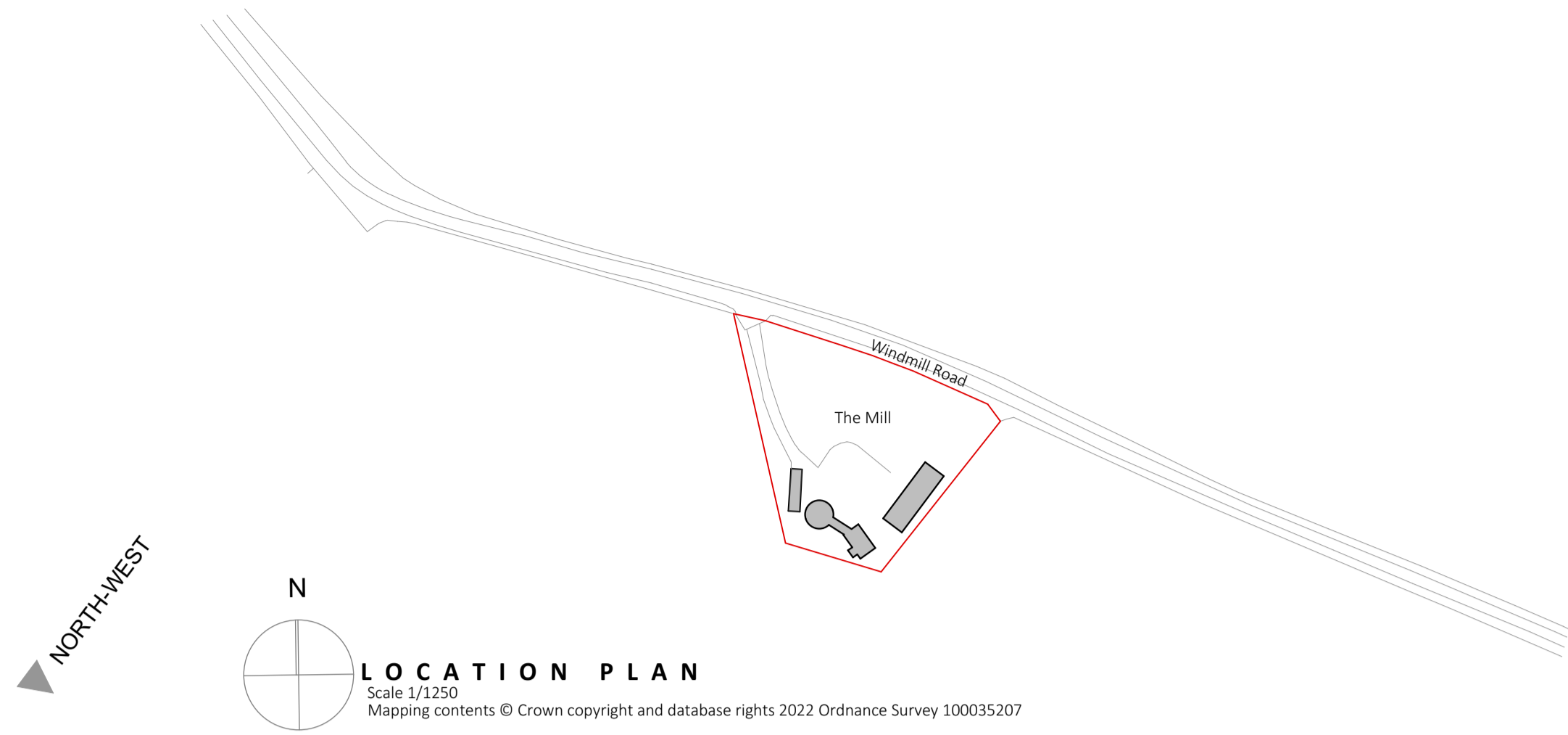
LOCATION PLAN Scale 1/1250 Mapping contents