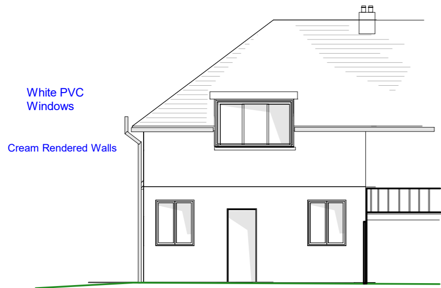
NORTH ELEVATION REAR