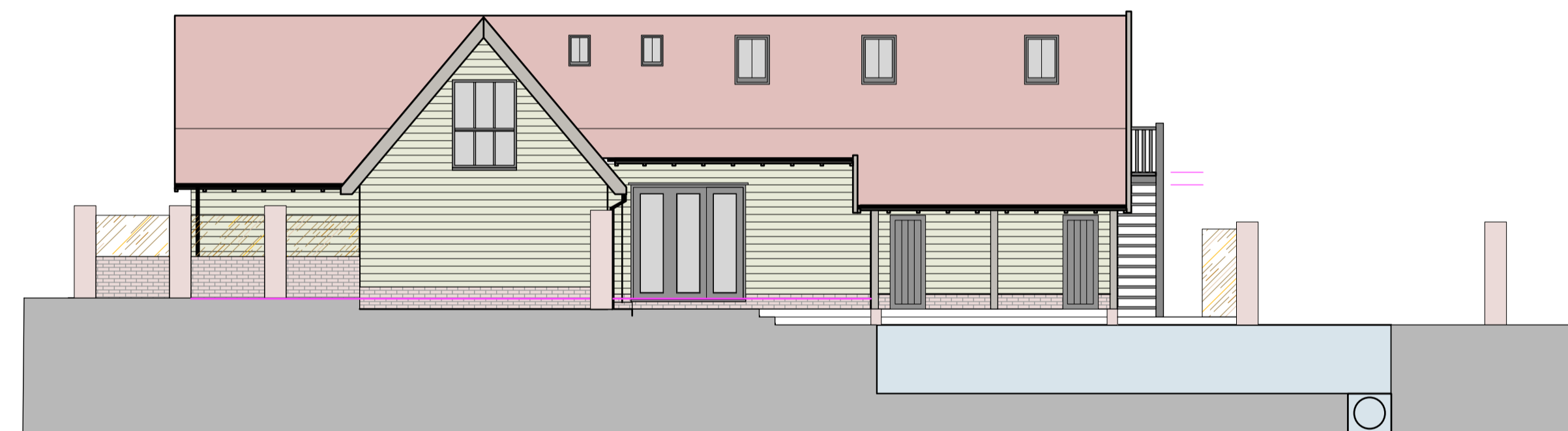
EXISTING SOUTH WEST ELEVATION - BARN