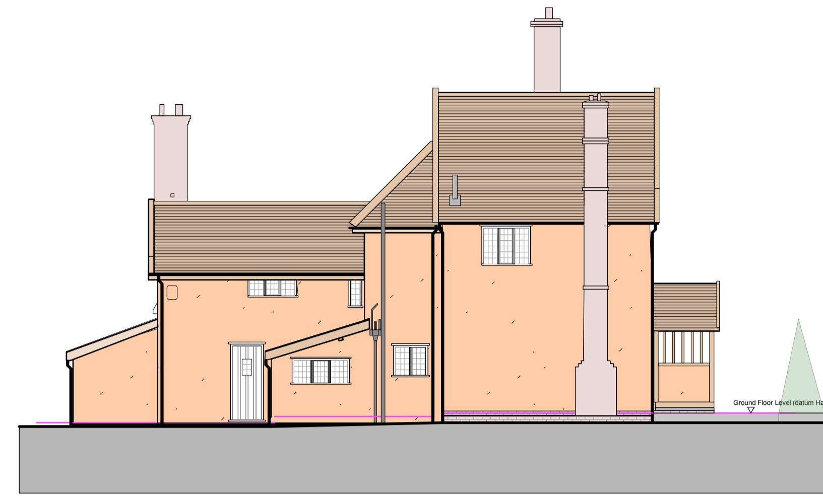
EXISTING NORTH EAST ELEVATION