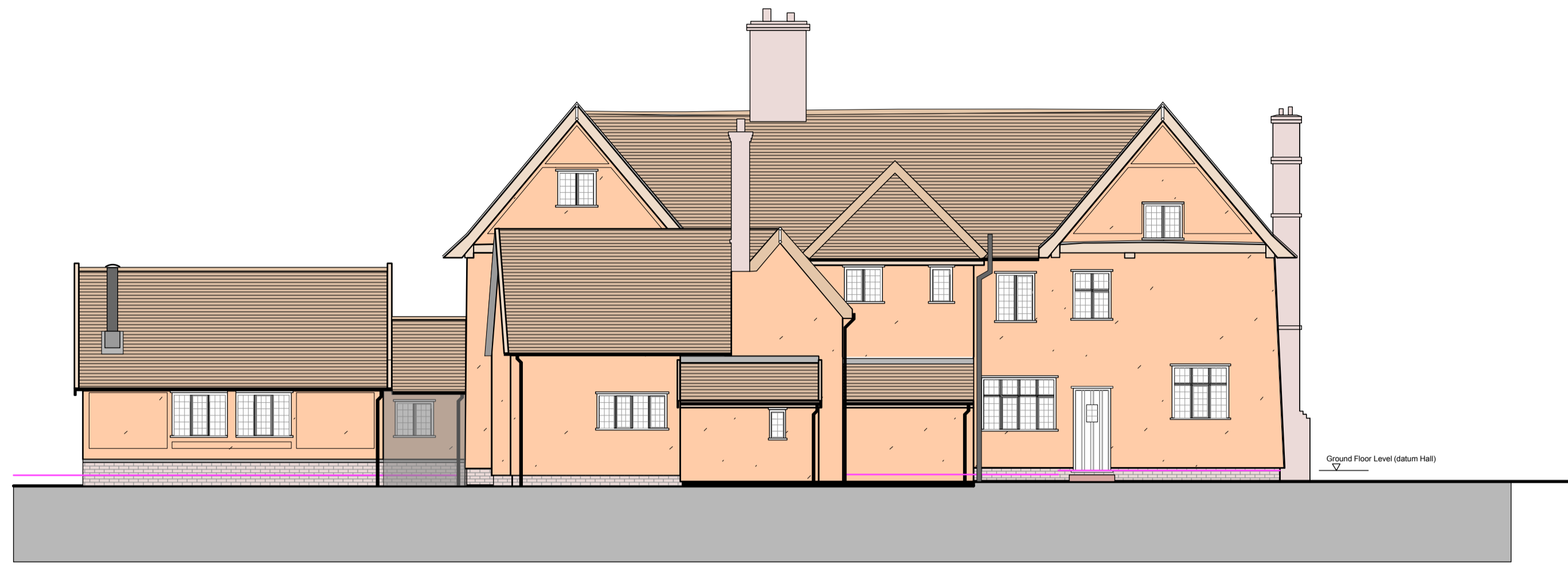
EXISTING SOUTH EAST ELEVATION

General Notes 1. Do not scale this drawing. All dimensions to be as noted. Contractor to check all dimensions on site before carry out works. 2. This drawing is for the private and confidential use of the client for whom it was undertaken and it should not be reproduced in whole or in part or relied upon by third parties for any use without the express written authority of Beech Architects Limited.