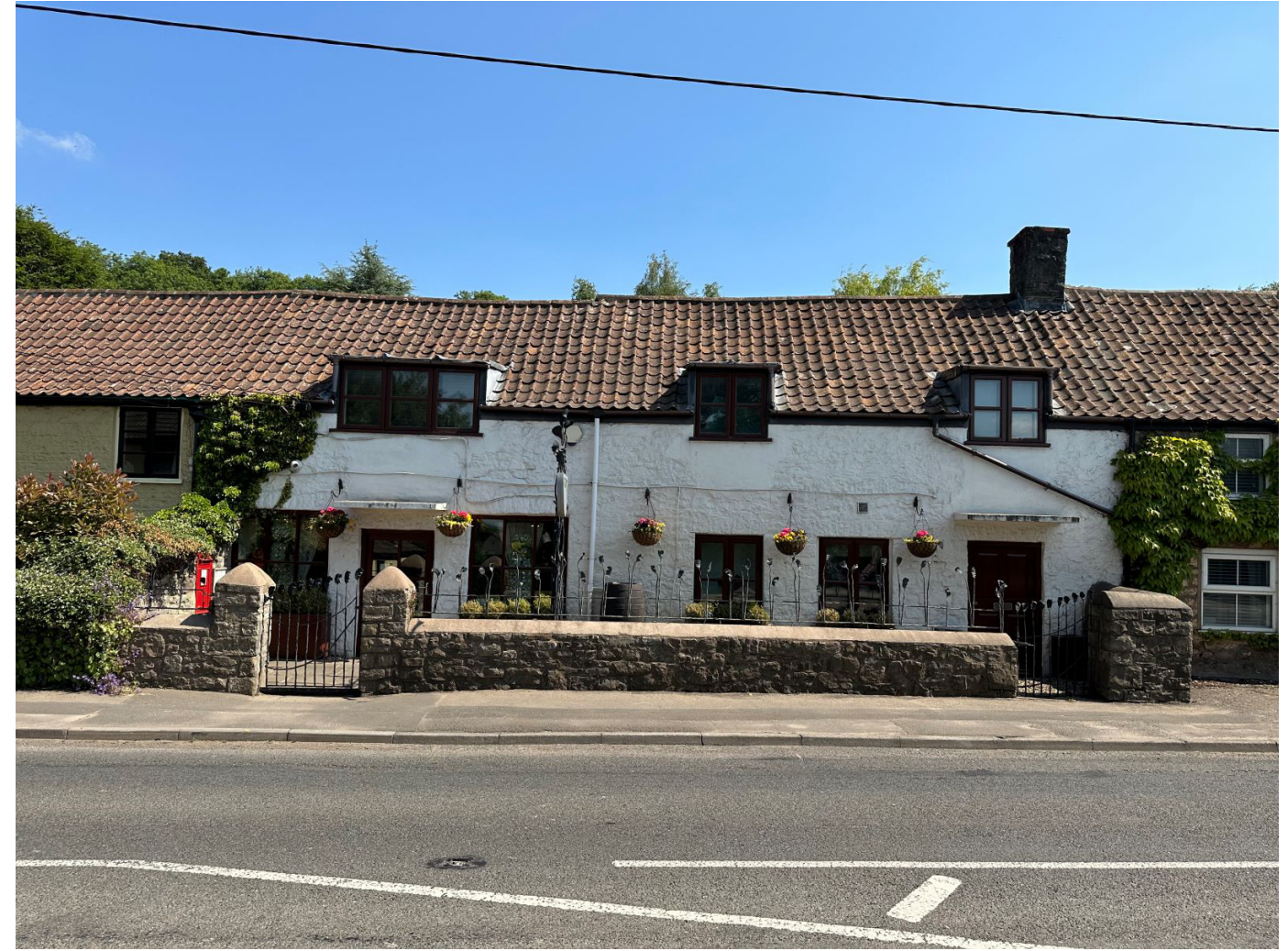
Photograph of the front of the property taken from the opposite side of the main road

Produced on 25 May 2023 from the Ordnance Survey National Geographic Database and incorporating surveyed revision available at this date. This map shows the area bounded by 346185 166253, 346327 166253, 346327 166395, 346185 166395, 346185 166253 Crown copyright and database rights 2023 OS 100054135. Supplied by copla ltd trading as UKPlanningMaps.com a licensed Ordnance Survey partner (OS 100054135). Data licence expires 25 May 2024. Unique plan reference: v2c/954723/1287441