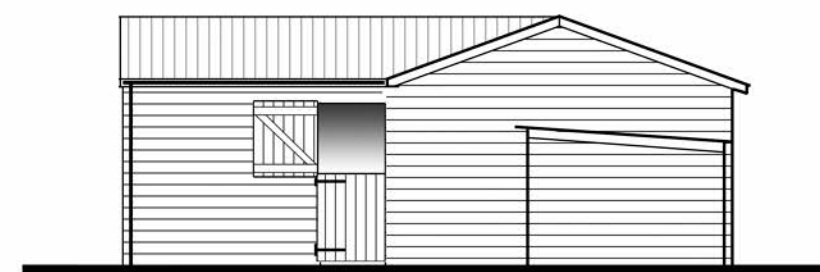
:: Side (North) :: Existing :: 1:100 at A3 ::

Roof: Profiled steel sheeting colour: dark green Walls: SW featheredge boarding with black stain finish Joinery: SW with black stained finish