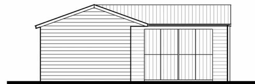
:: Side (South) :: Existing :: 1:100 at A3 ::