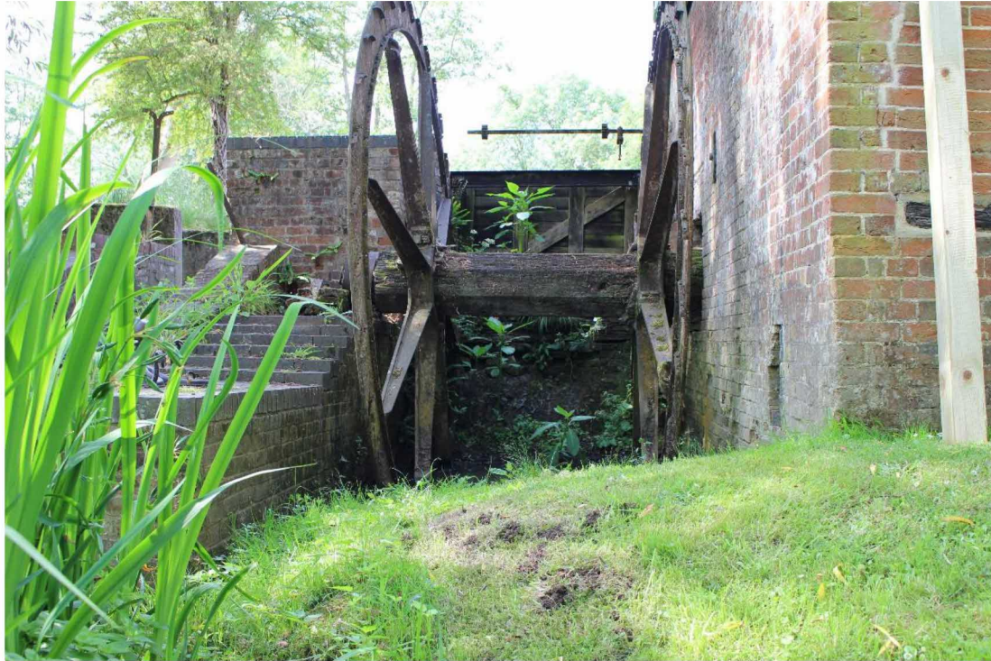
Figure 3: Before