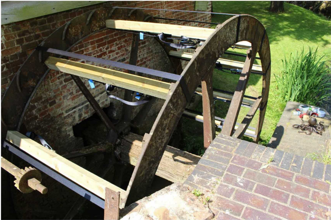
Figure 6: After