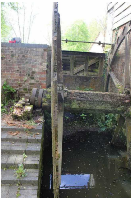
Figure 1: Before

Result: Successful treatment. The wheel frames are now secure and stable and posing no safety risk.