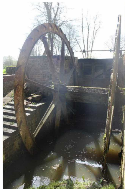
Figure 2: Before