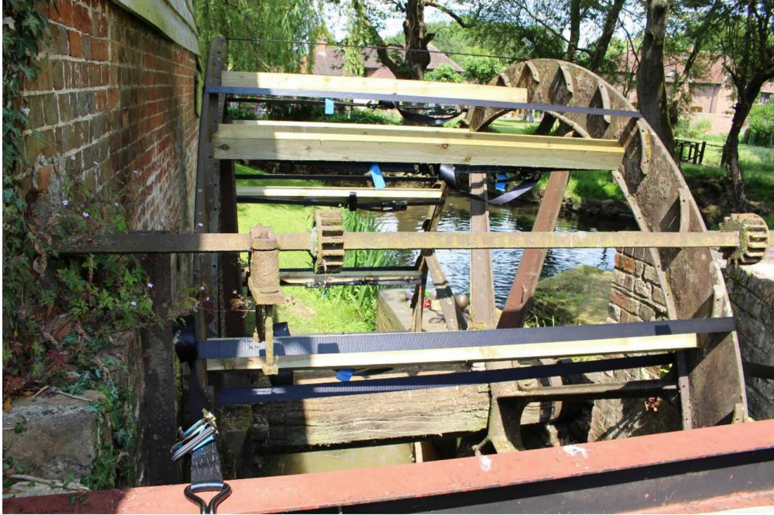
Figure 5: After