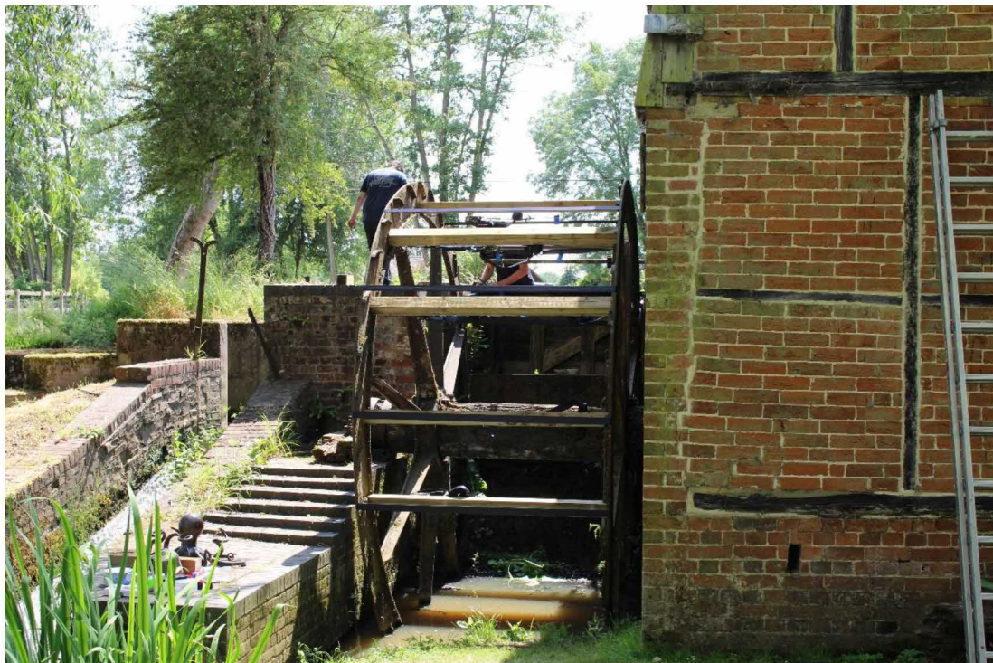
Figure 4: During