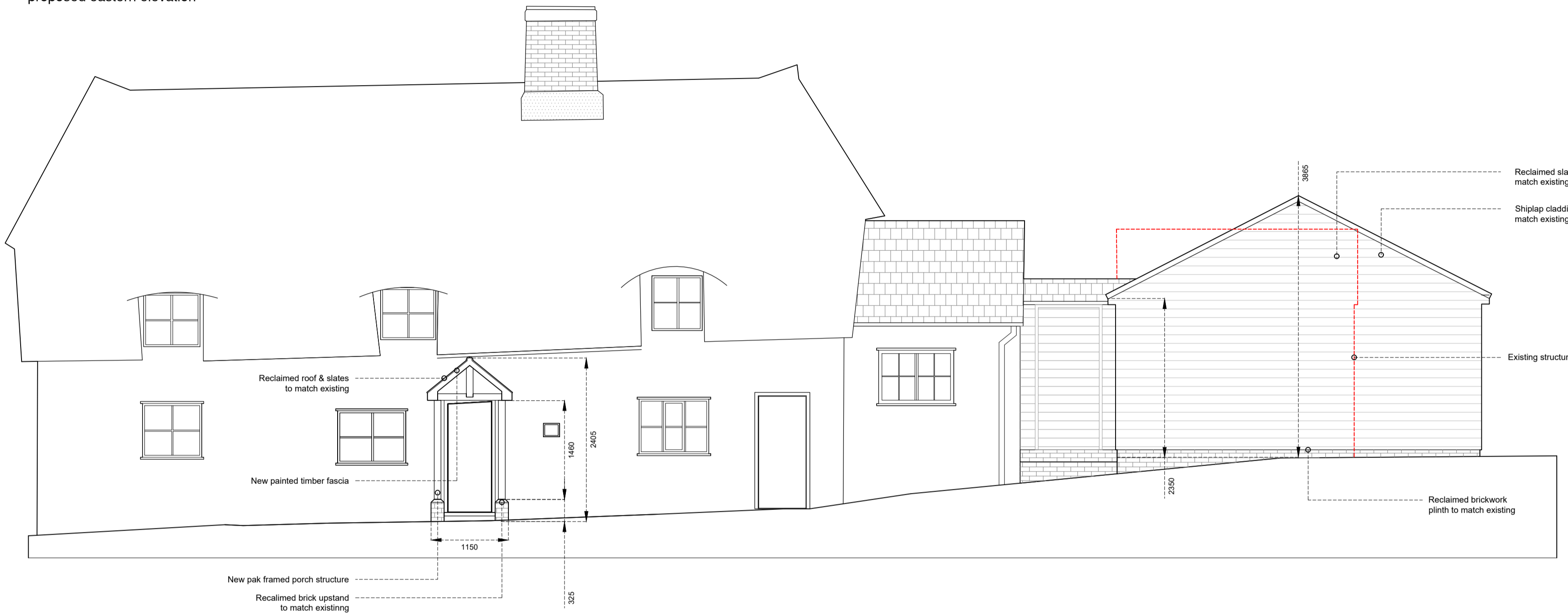
proposed eastern elevation