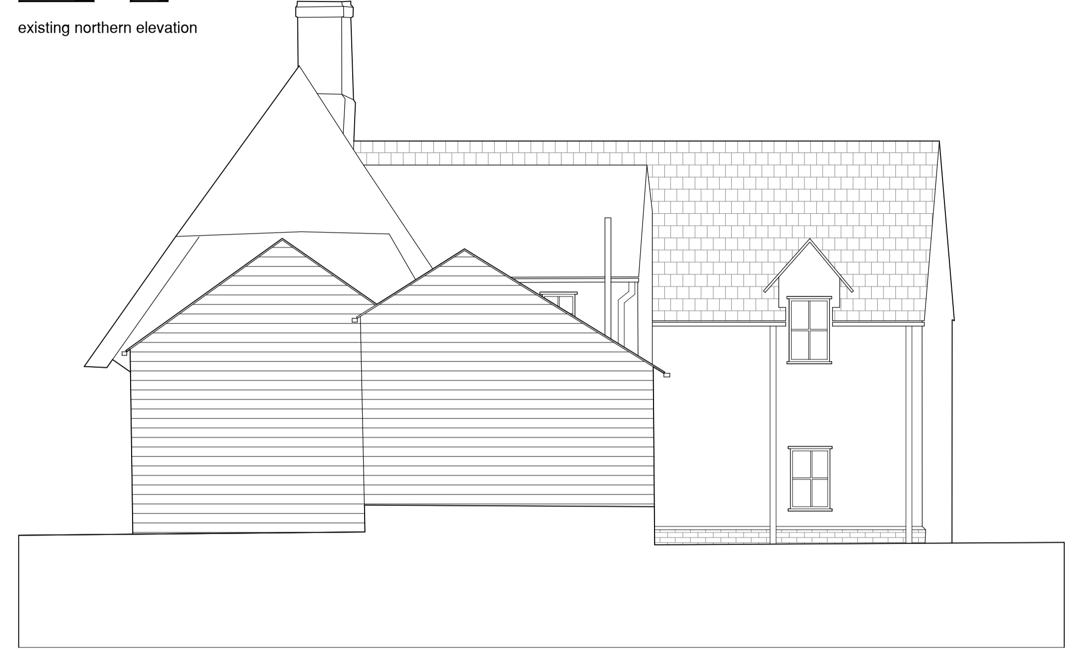
existing northern elevation