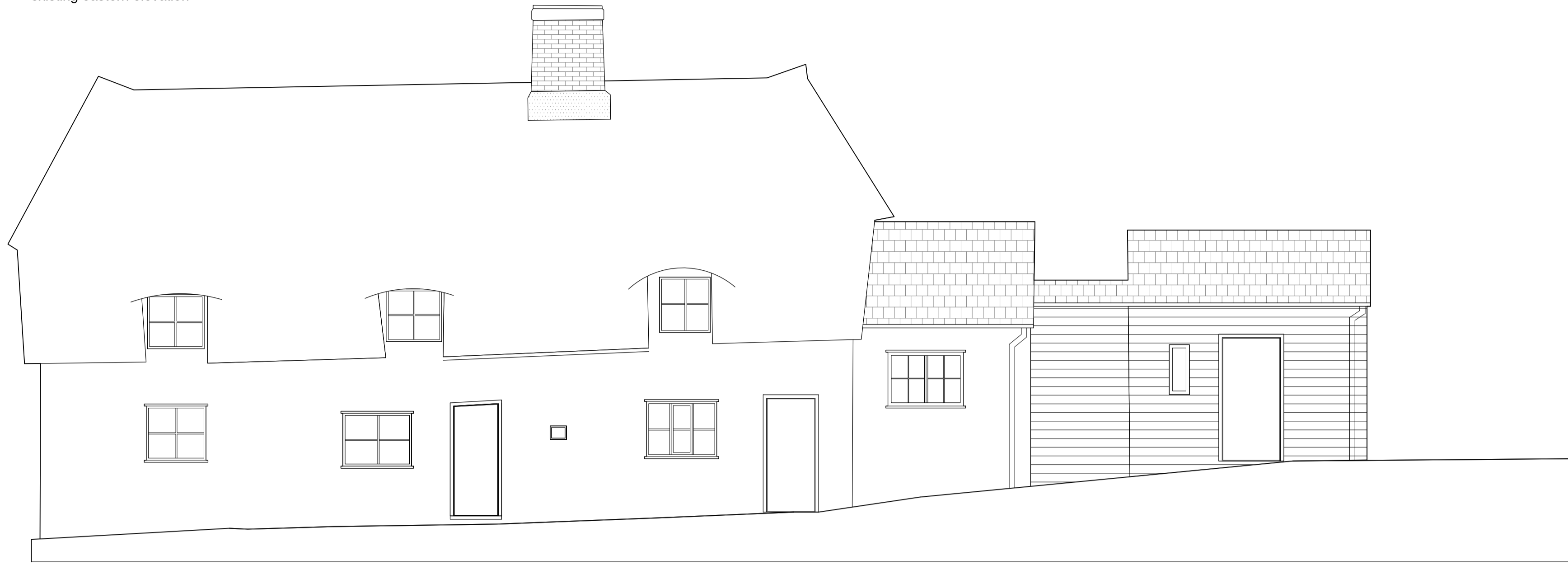
existing eastern elevation