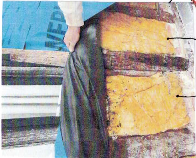
MINERAL WOOL INSULATION REPLACED WITH SHEEPS WOOL INSULATION