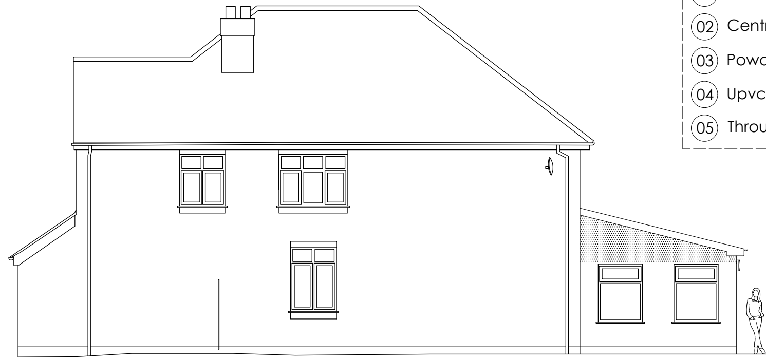
Proposed Southwest Elevation scale 1:100@A3