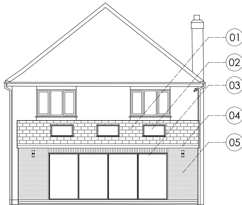
Proposed Southeast Elevation scale 1:100@A3