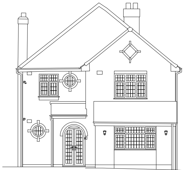
Proposed Northwest Elevation scale 1:100@A3