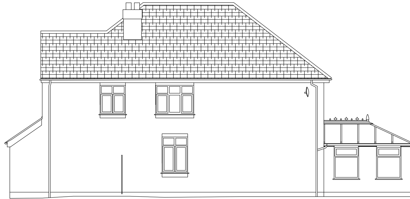
Existing Southwest Elevation scale 1:100@A3