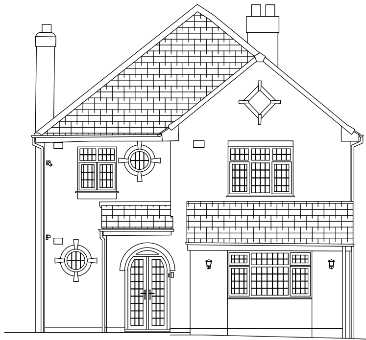
Existing Northwest Elevation scale 1:100@A3