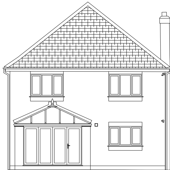
Existing Southeast Elevation scale 1:100@A3