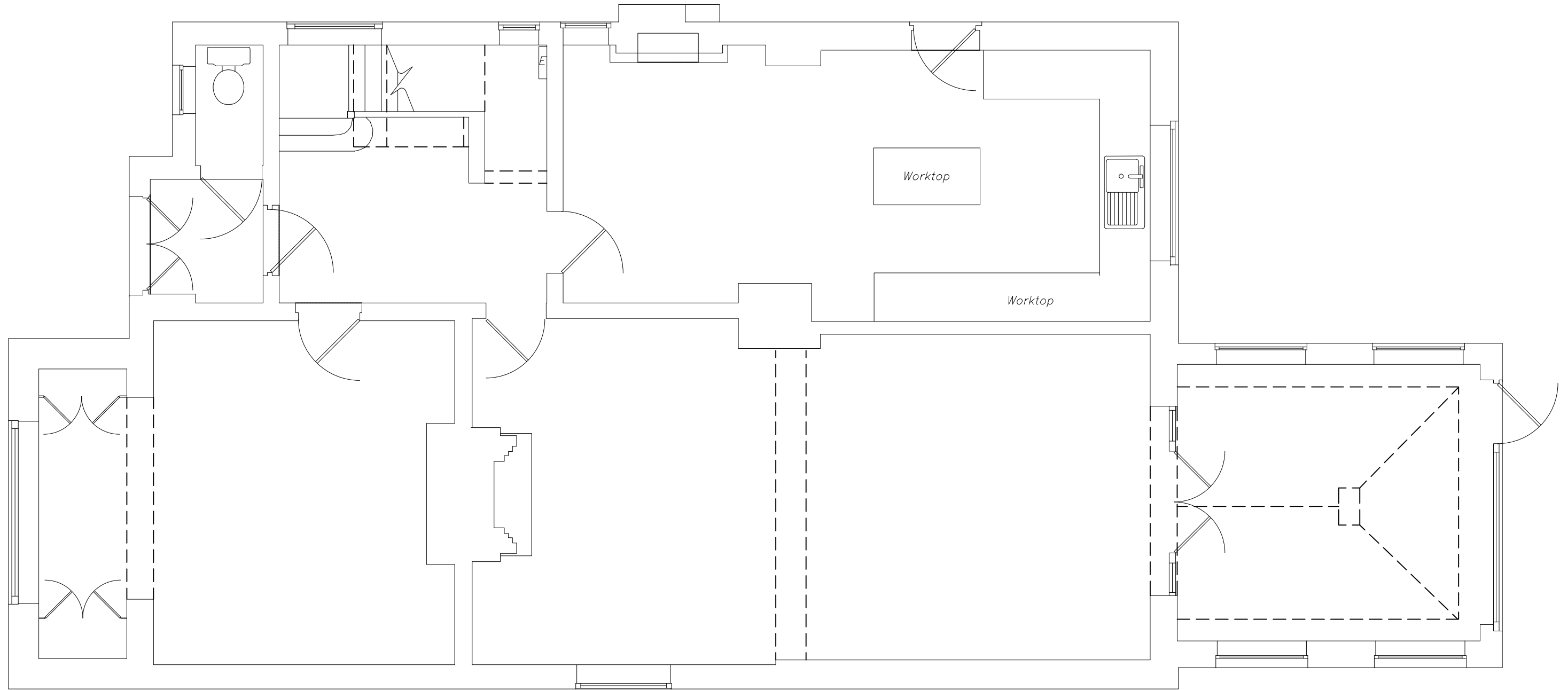
Existing Ground Floor Plan scale 1:50@A3