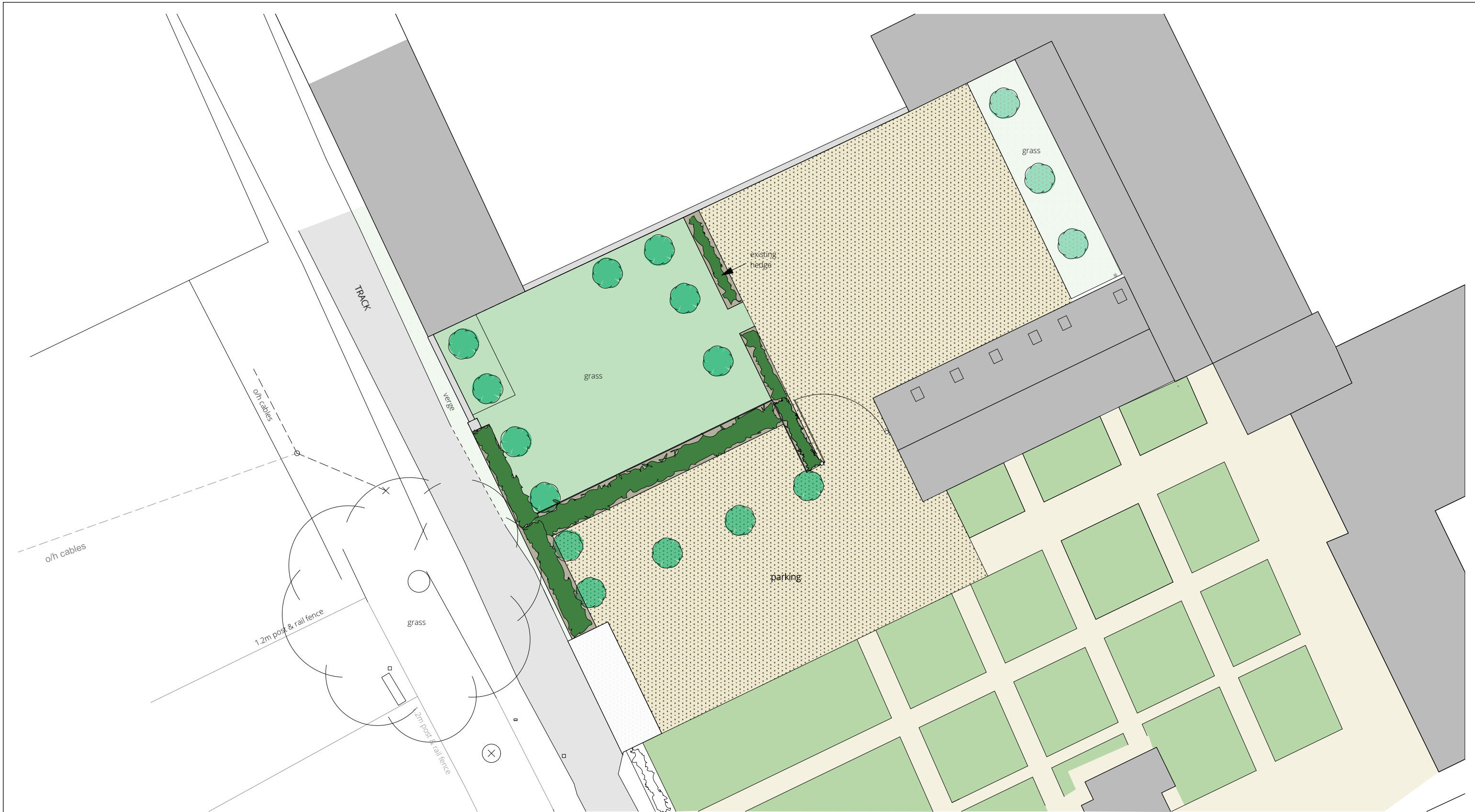
Site Plan as proposed Scale 1:200

Ordnance Survey (c) Crown Copyright 2022. All rights reserved. Licence number 100022432