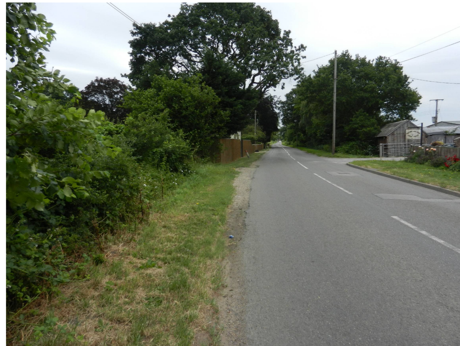
AS VIEWED FROM THE EASTBOUND CARRIAGEWAY