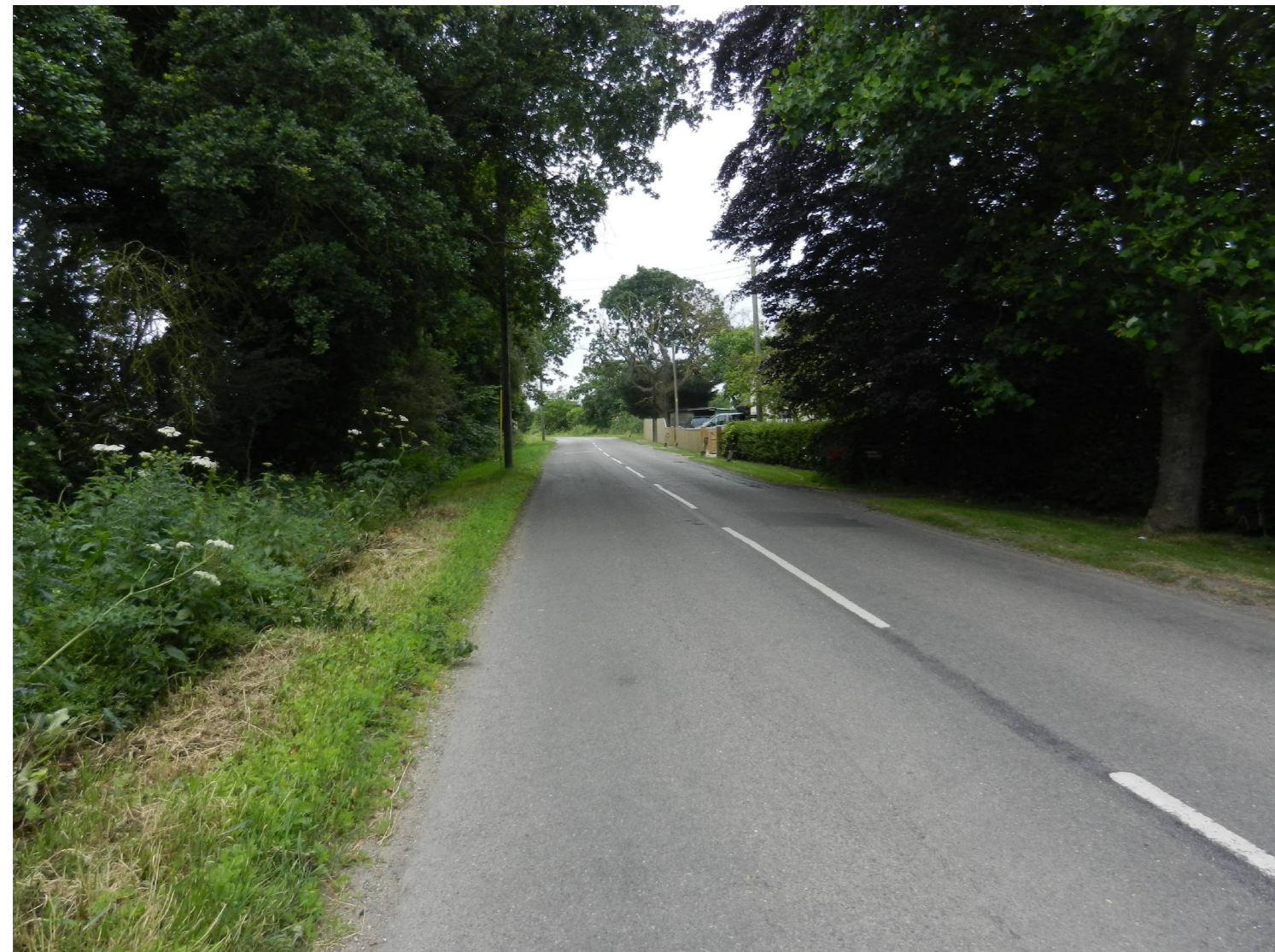
AS VIEWED FROM THE WESTBOUND CARRIAGEWAY