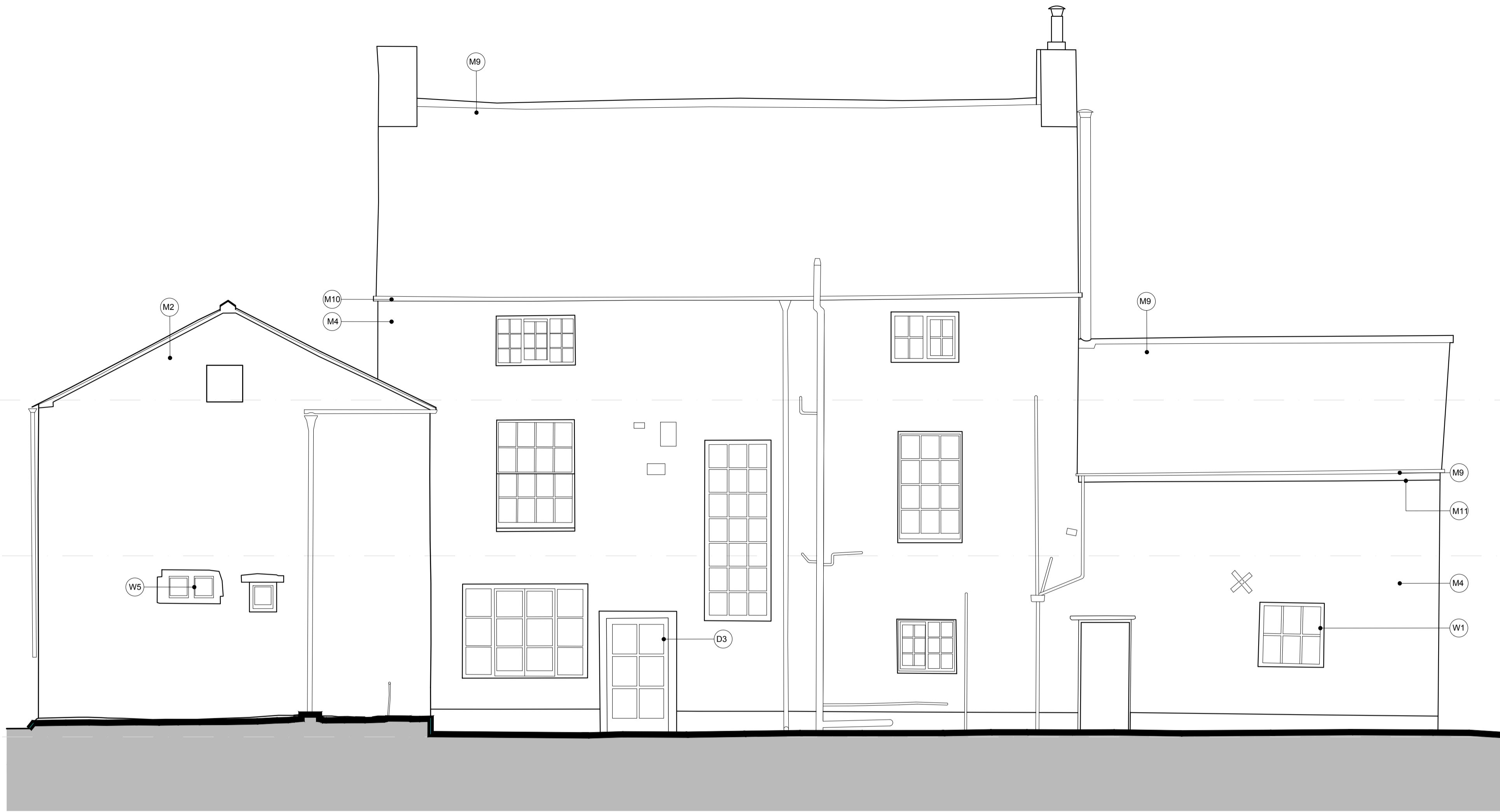
Elevation 3 - North-East as 'Existing'