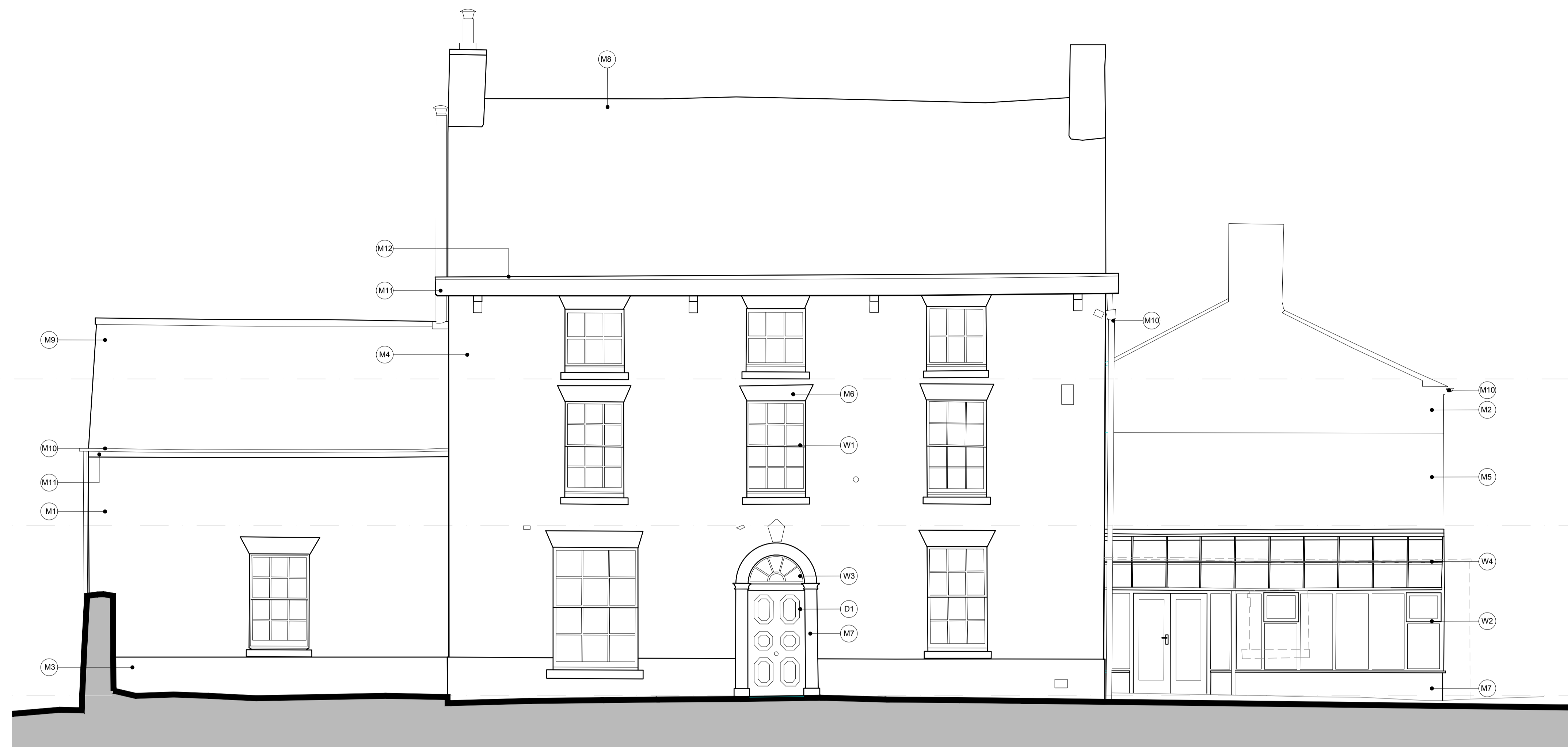
Elevation 1 - South-West as 'Existing'