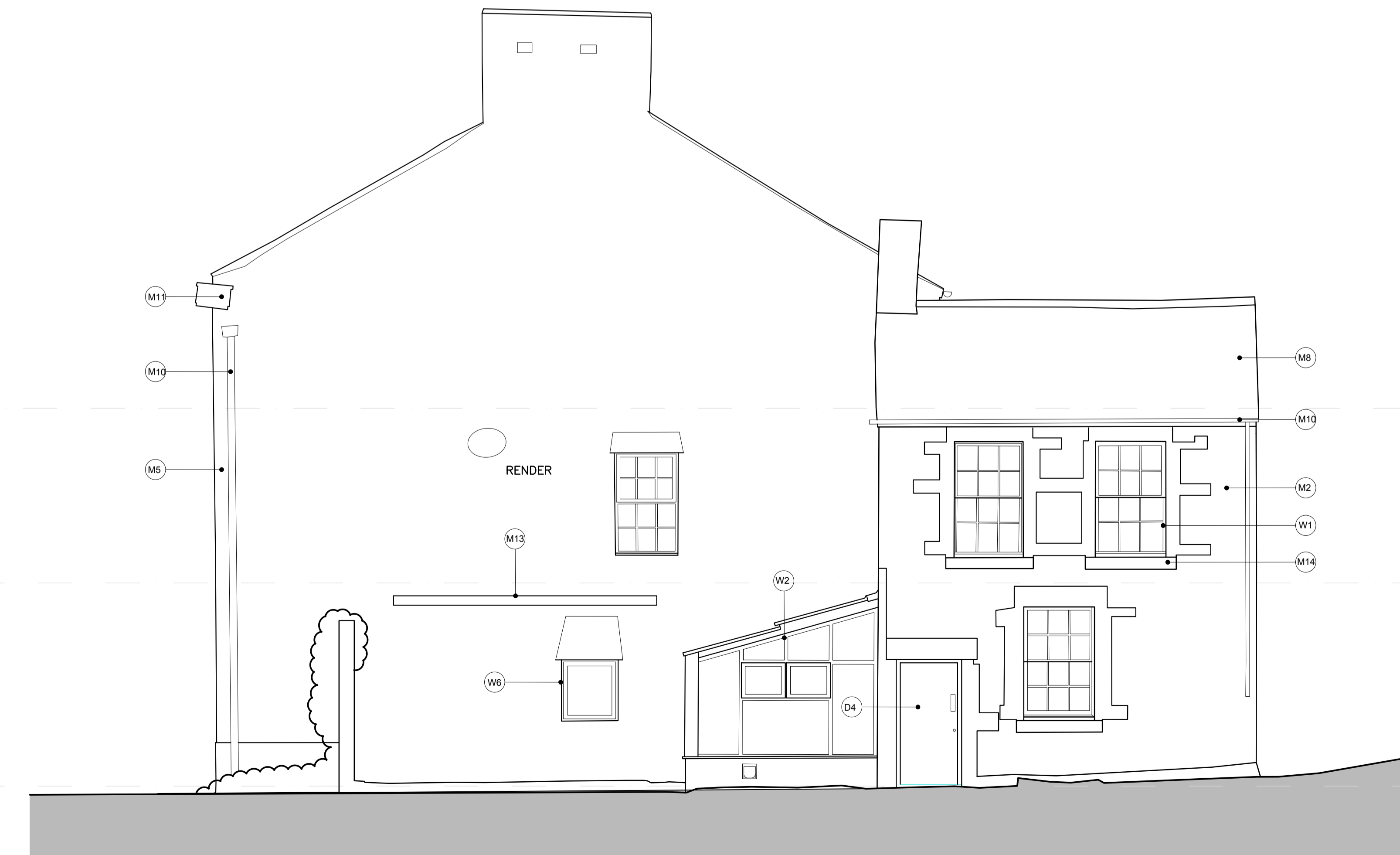
Elevation 2 - South-East as 'Existing'