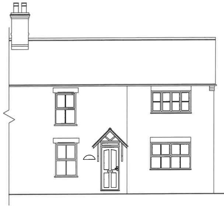
FRONT ELEVATIONS 1:100