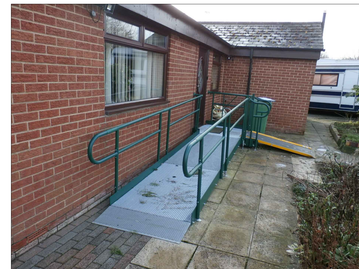
Temporary ramp to front door

Written dimensions on these drawings shall take precedence over scaled dimensions. Contractors shall verify and be responsible for all dimensions and conditions on the project and Airedale Architects must be notified of any variations from the dimensions and conditions shown by these drawings prior to commencement of any work. All contractors are deemed to have made themselves aware of site conditions prior to entering into any contract.