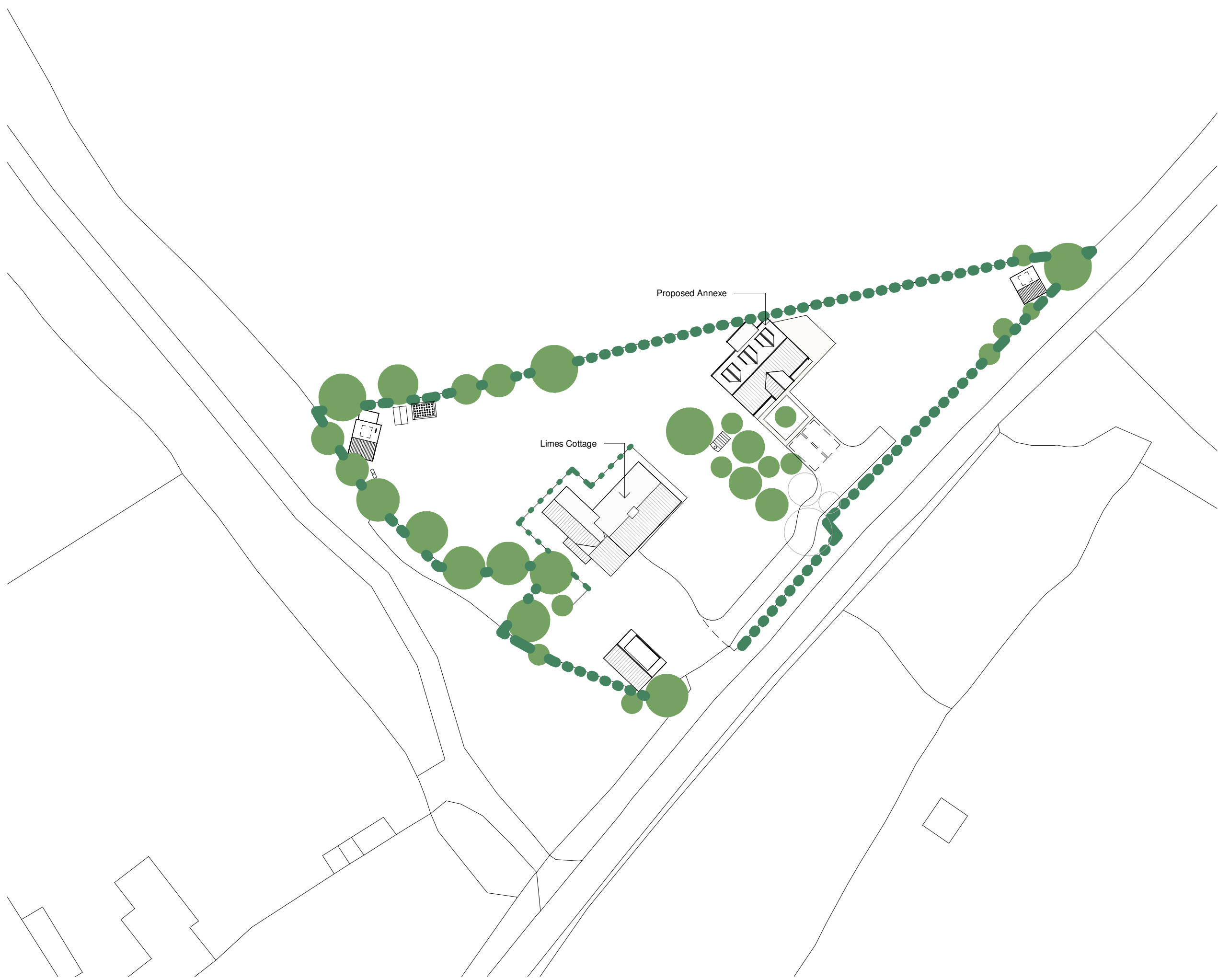
Block Plan As Proposed 1 : 500