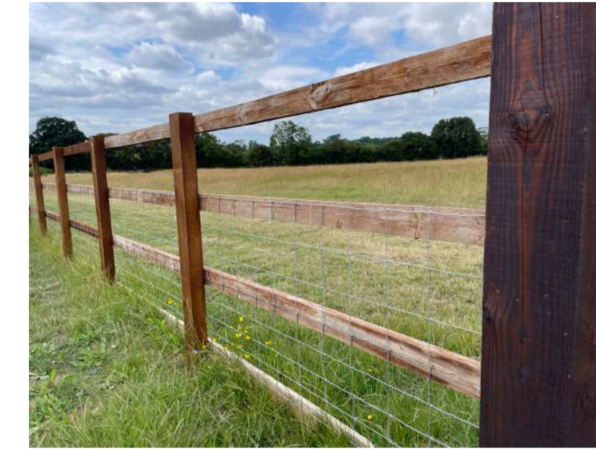
Proposed post & rail fence to match existing