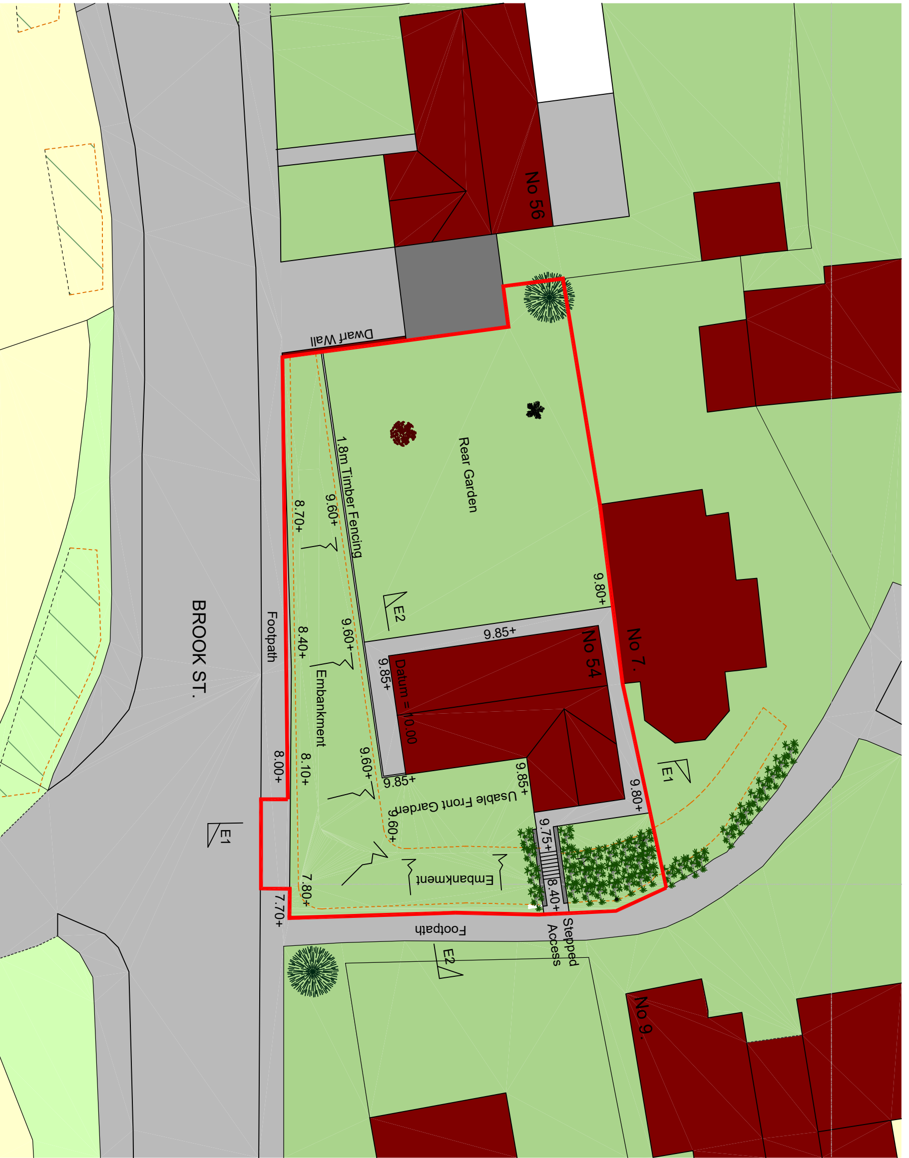
EXISTING SITE BLOCK PLAN.