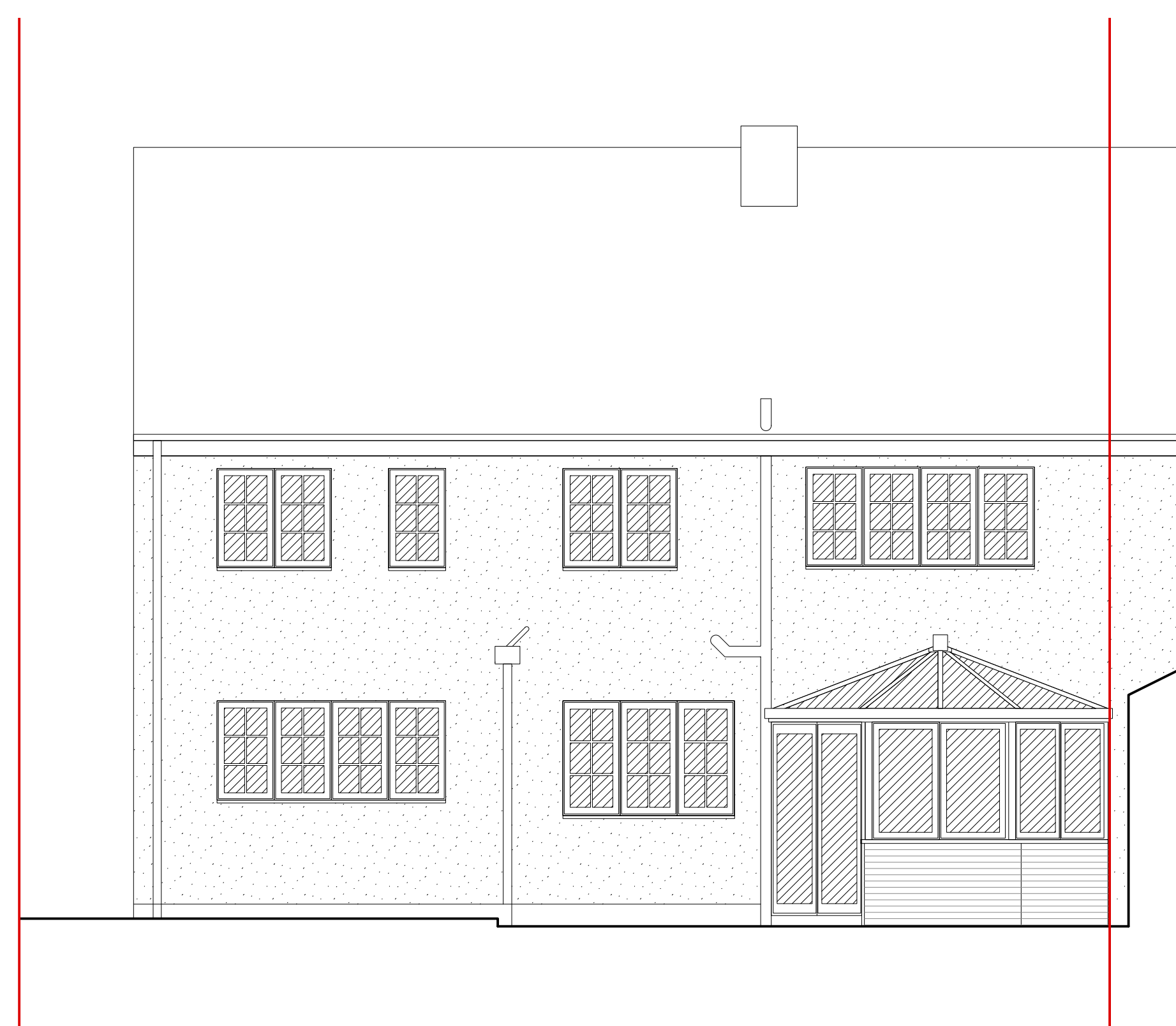
02 | EXISTING REAR ELEVATION