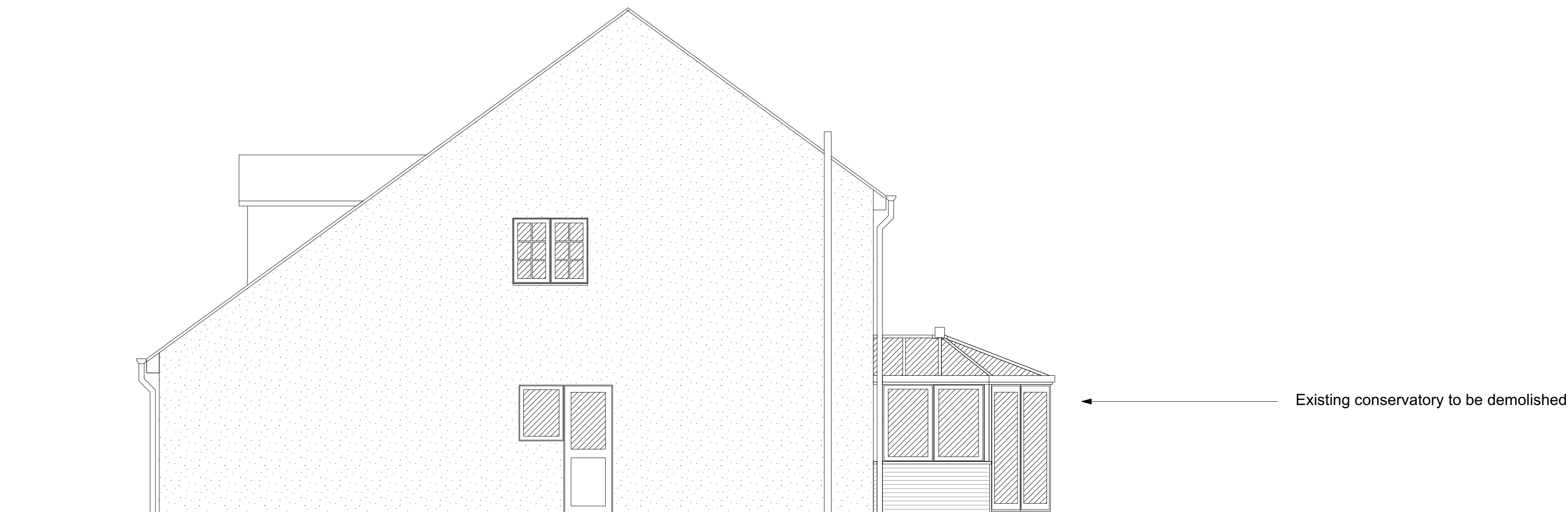
03 | EXISTING SIDE ELEVATION

Issue Status SK Information F Feasibility D Design P Permissions S Scheme T Tender C Construction E Existing Condition