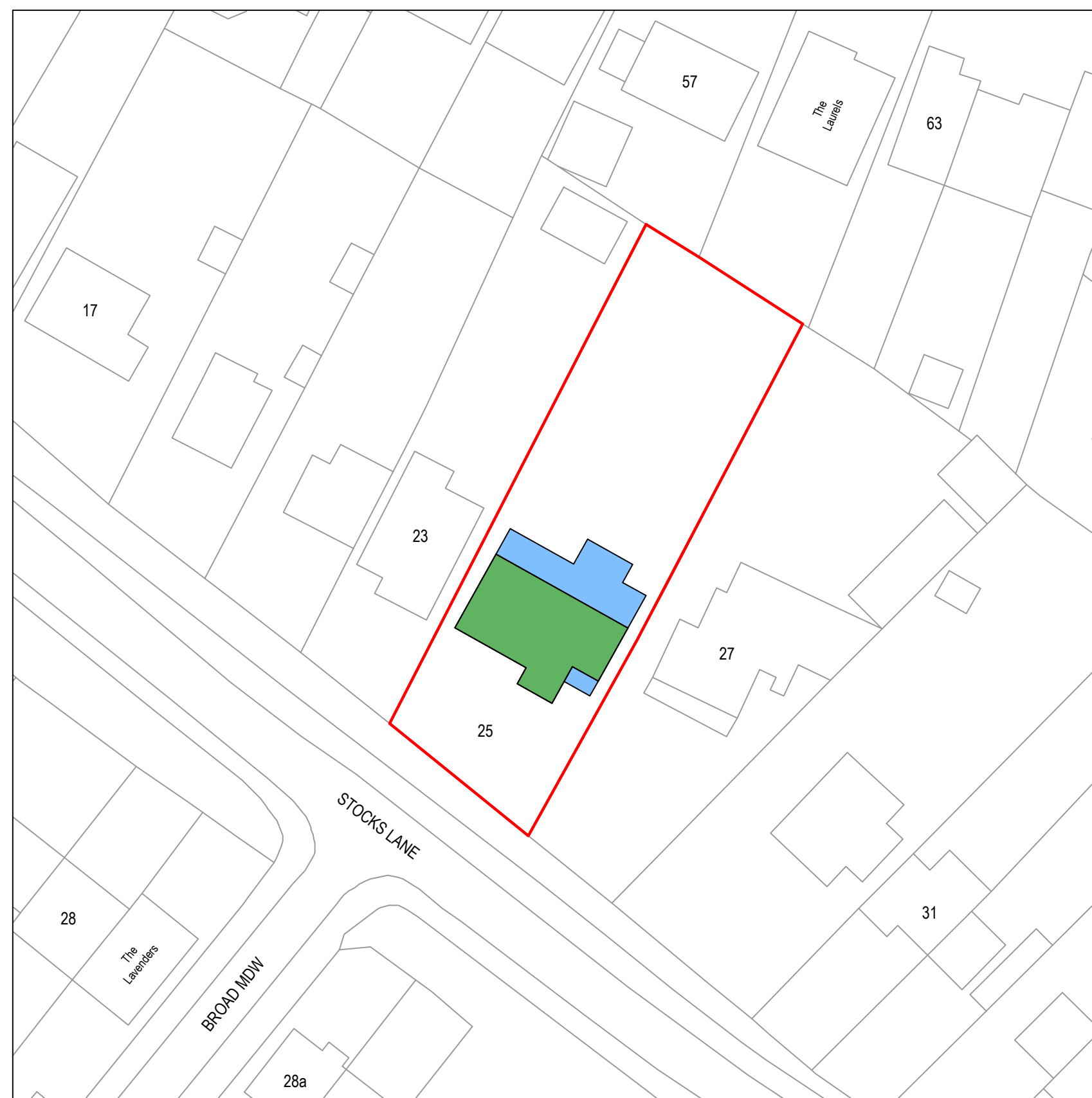
SITE BLOCK PLAN