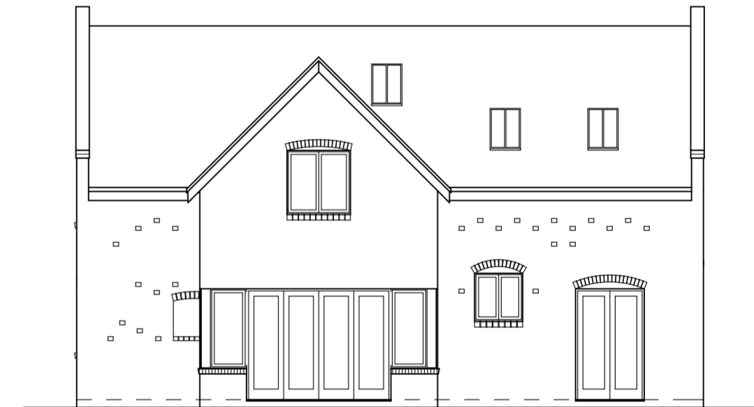
Side Elevation (facing Turnbull Rd)