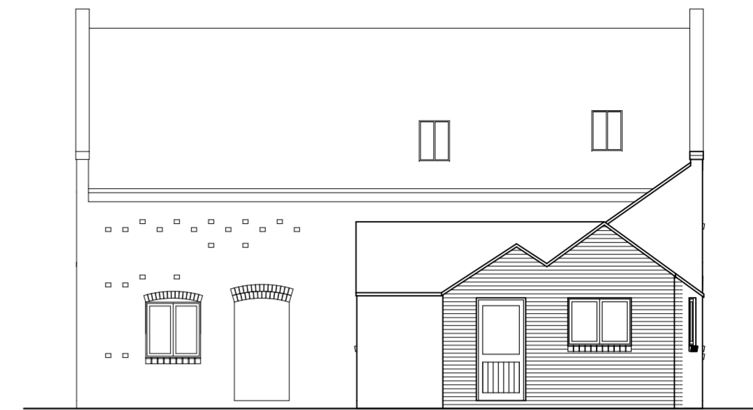
Side Elevation (facing Bridge Cottage)