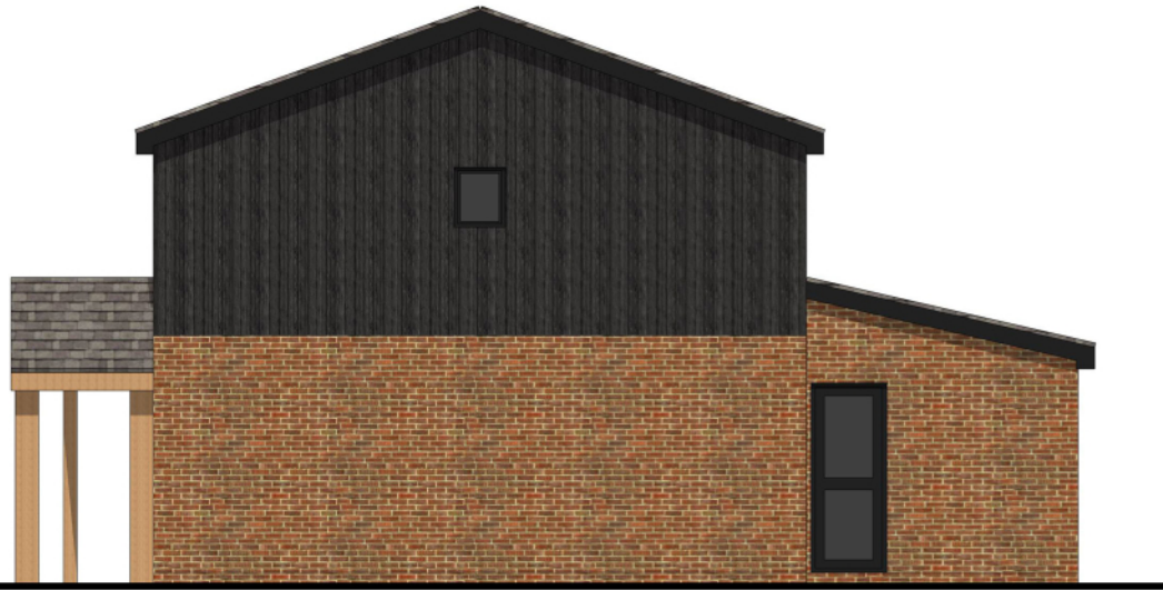
proposed side elevation 1 scale 1:100