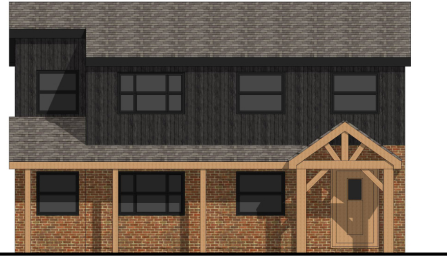
proposed front elevation scale 1:100