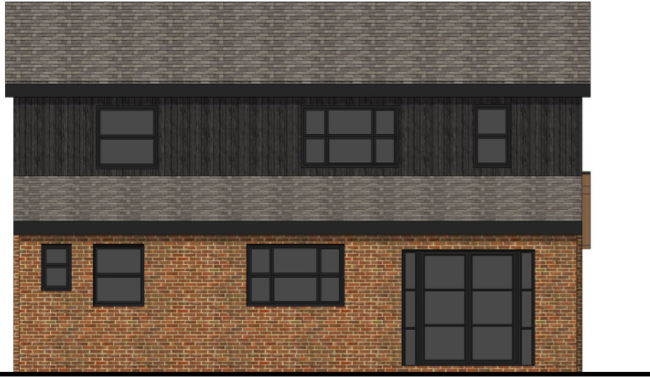
proposed rear elevation scale 1:100