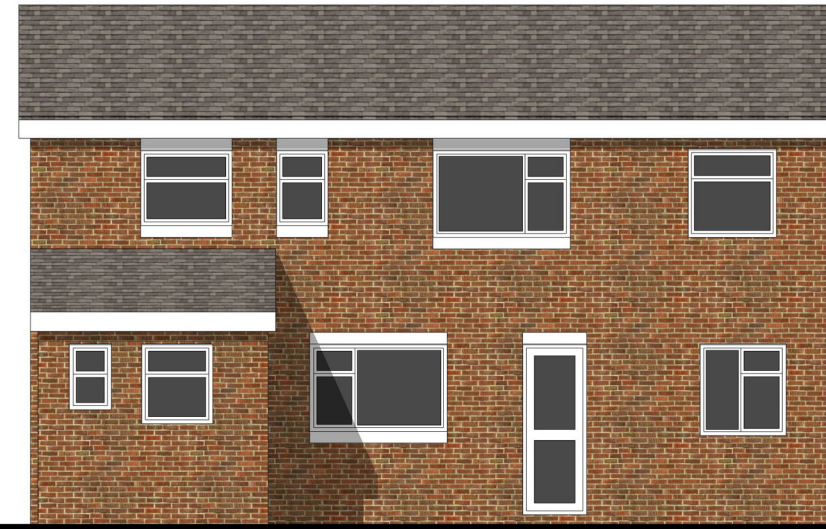
existing rear elevation scale 1:100