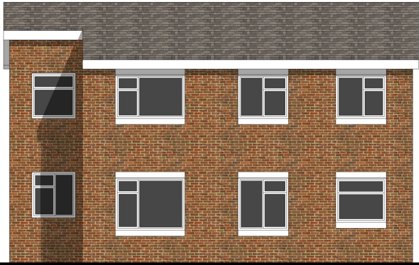
existing front elevation scale 1:100