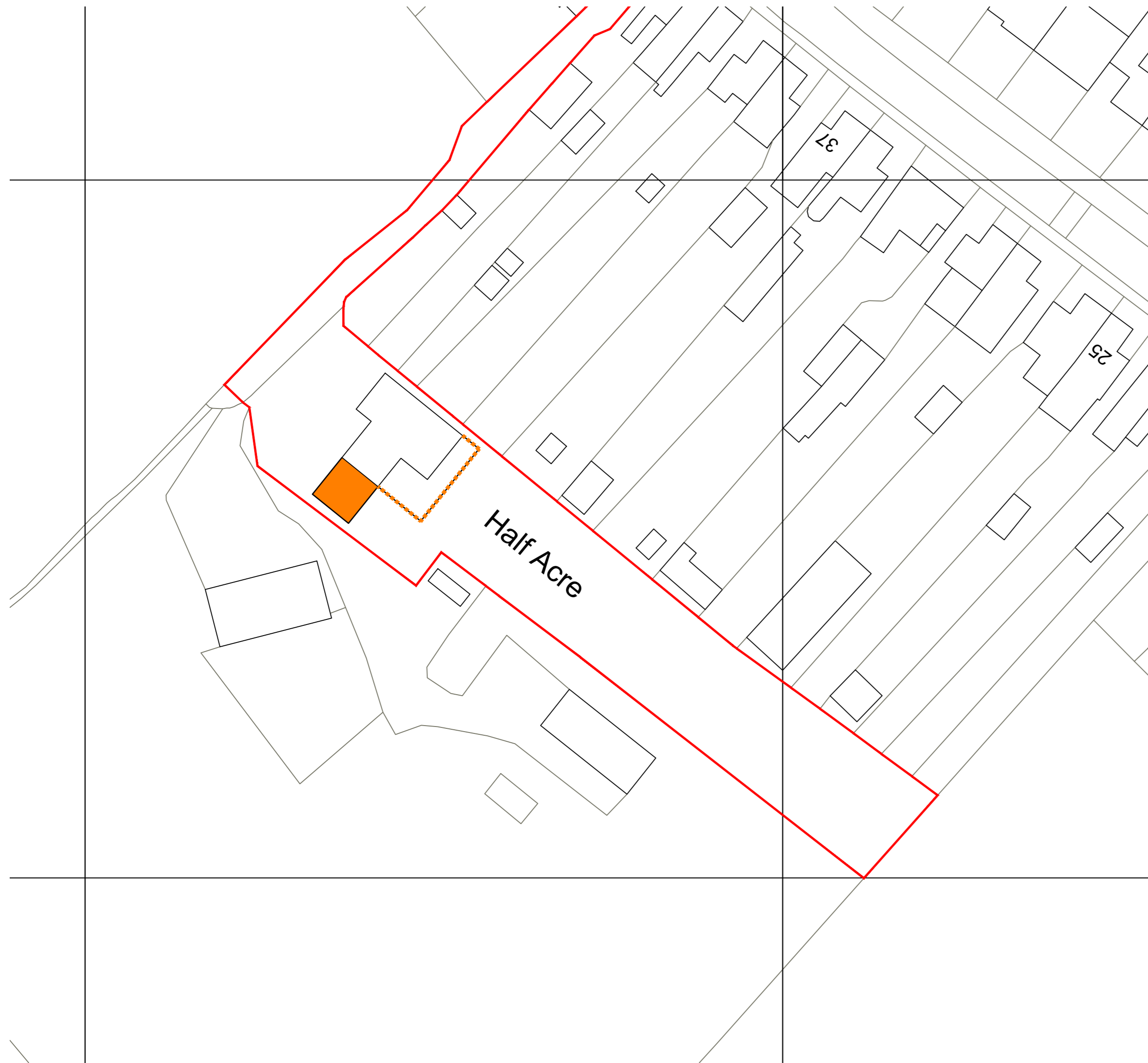
Proposed Site Plan - 1:500

Orange Dashed Line Denotes extent of proposed ground floor extension