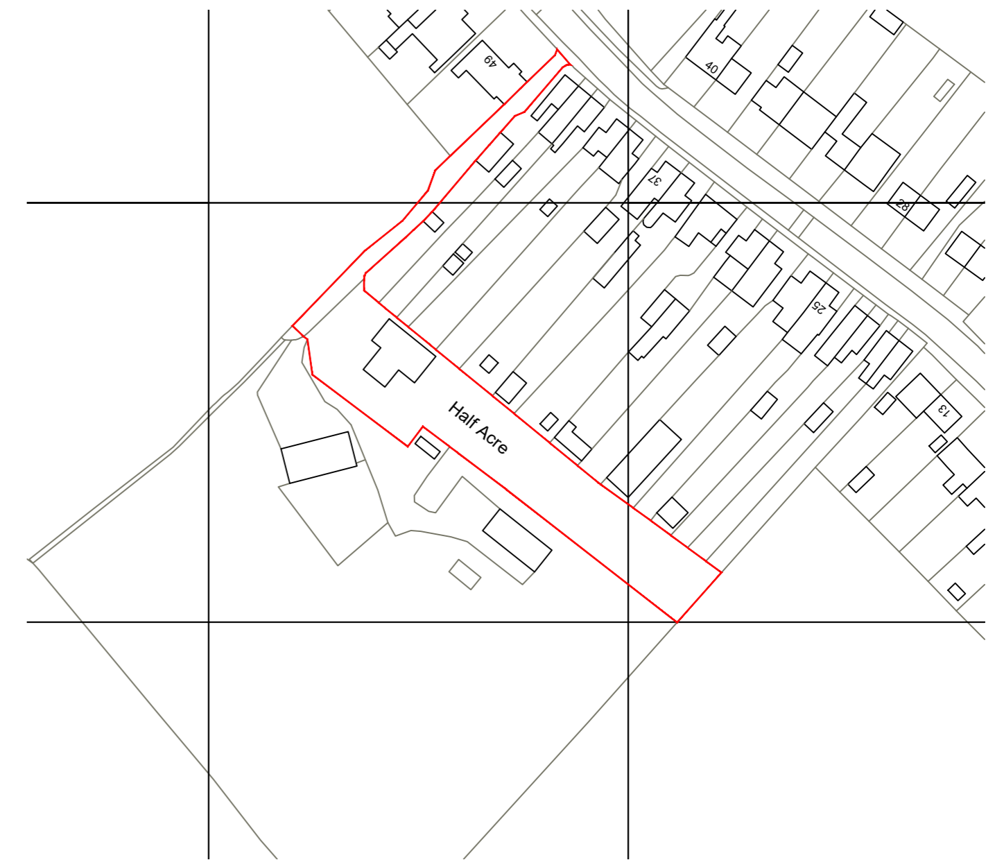
Location Plan - 1:1250