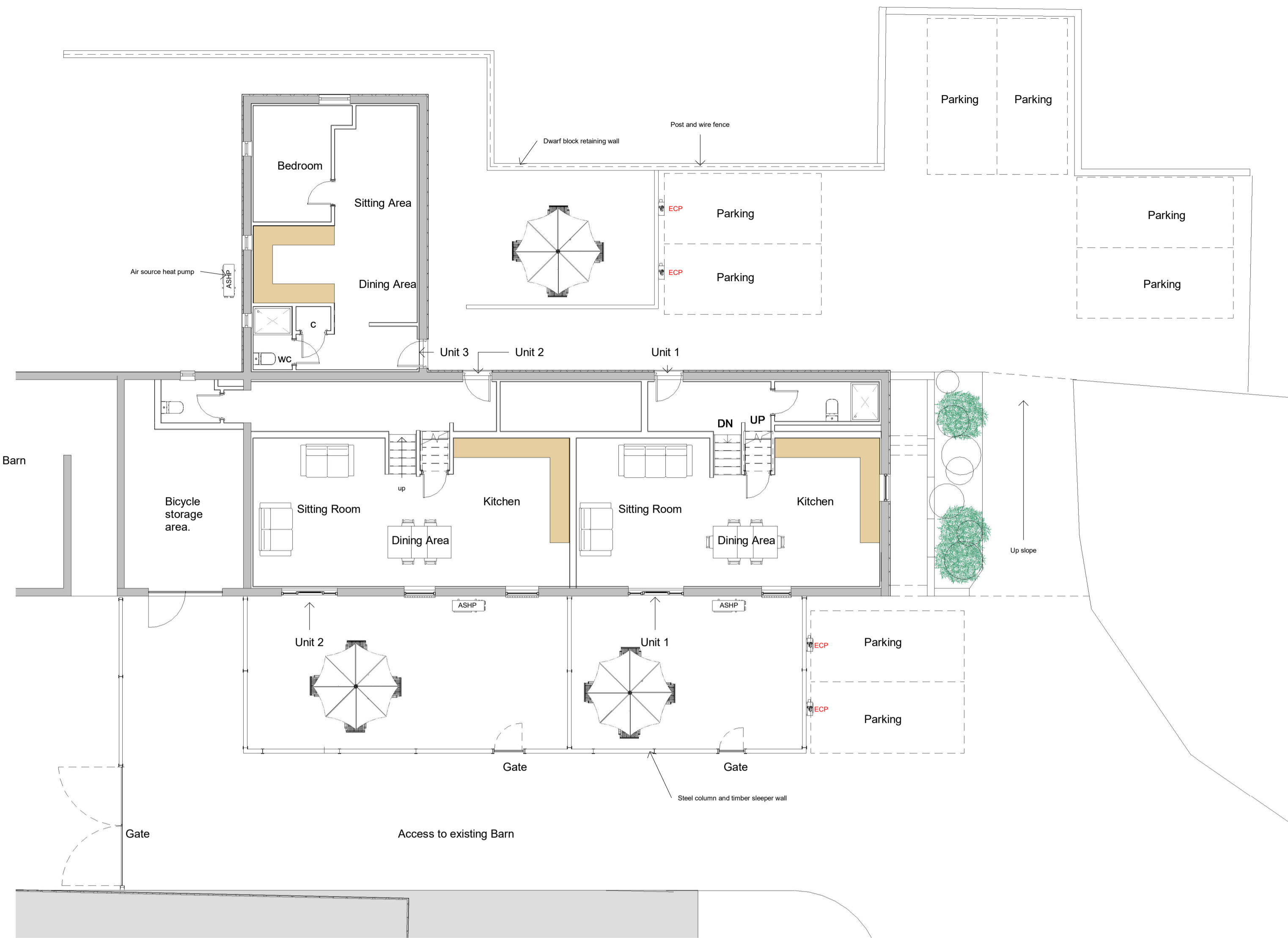
Ground Floor Plan. 1 : 100