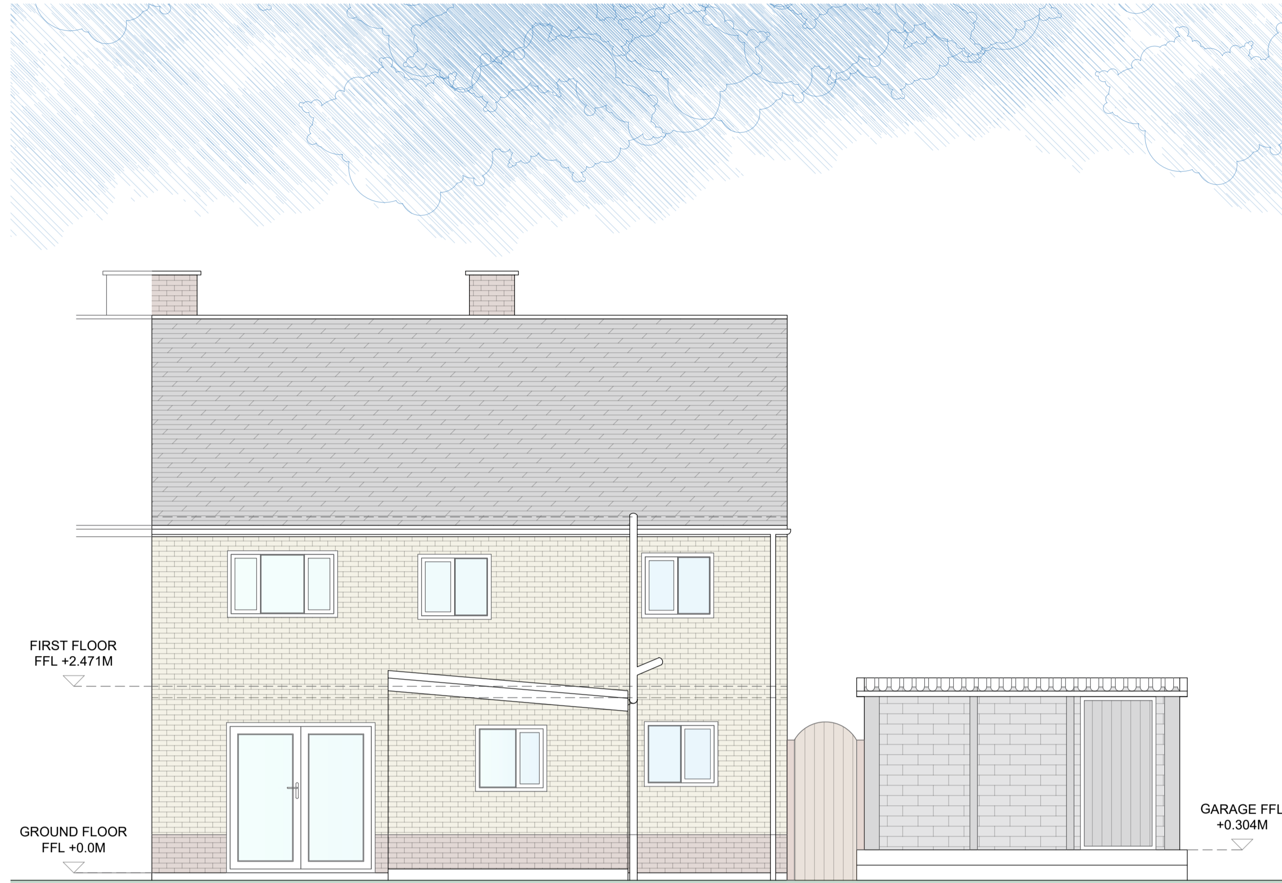
South-east Elevation Scale 1:50