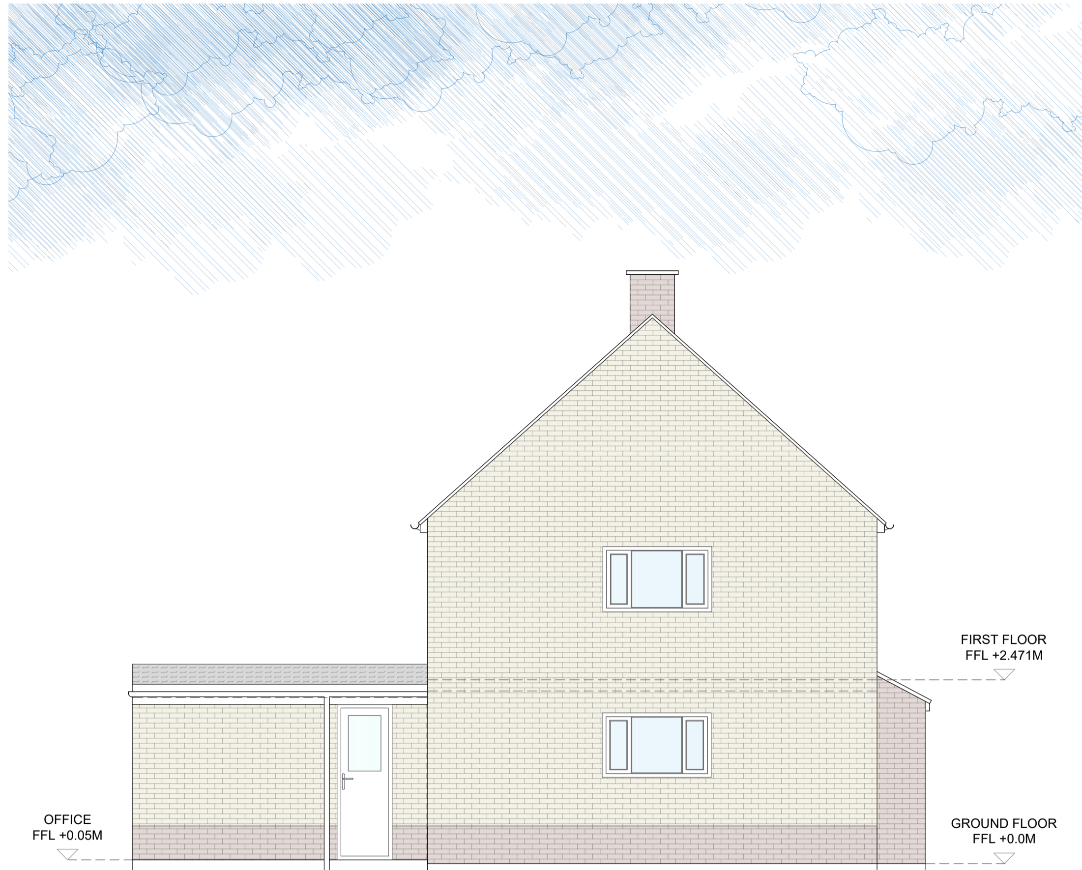
North-east Elevation Scale 1:50