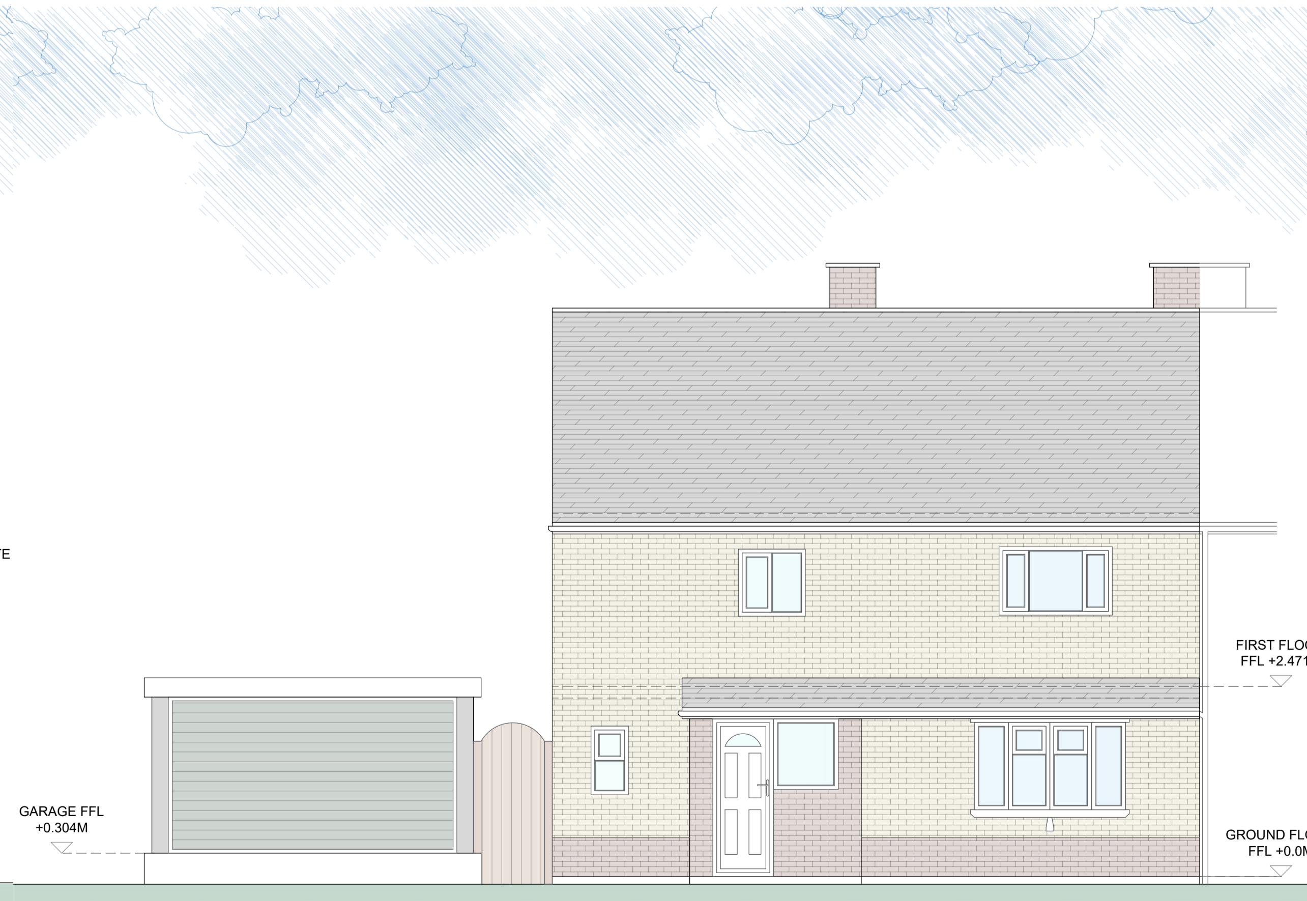
North-west Elevation Scale 1:50

Disclaimer PLANNING DRAWINGS All drawings are provided for planning purposes only. Drawings have been created from a non-intrusive survey and all dimensions must be checked on site before any work commences. If in doubt please contact the main contractor if one has been appointed. No responsibility can be taken with any errors if building from this drawing. Main Contractor To Set Any Works Out Prior To Build To Ensure Buildability Before Commencing Works. Any Required Party Wall Act Or Build Over Agreements Will Not Be Organized By Harbur Design And Will Need To Be Completed By The Client Or A 3rd Party.