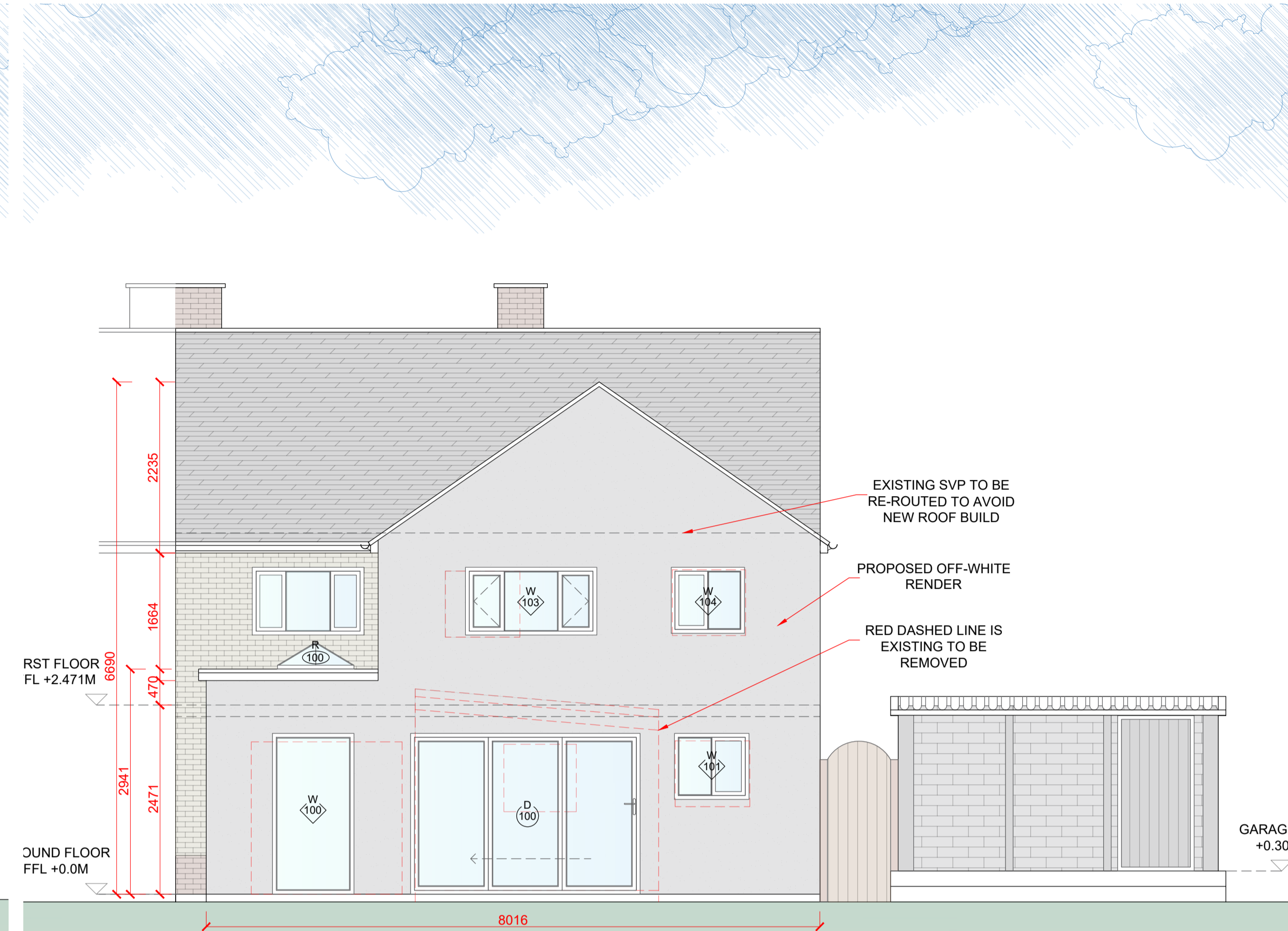
South-east Elevation Scale 1:50