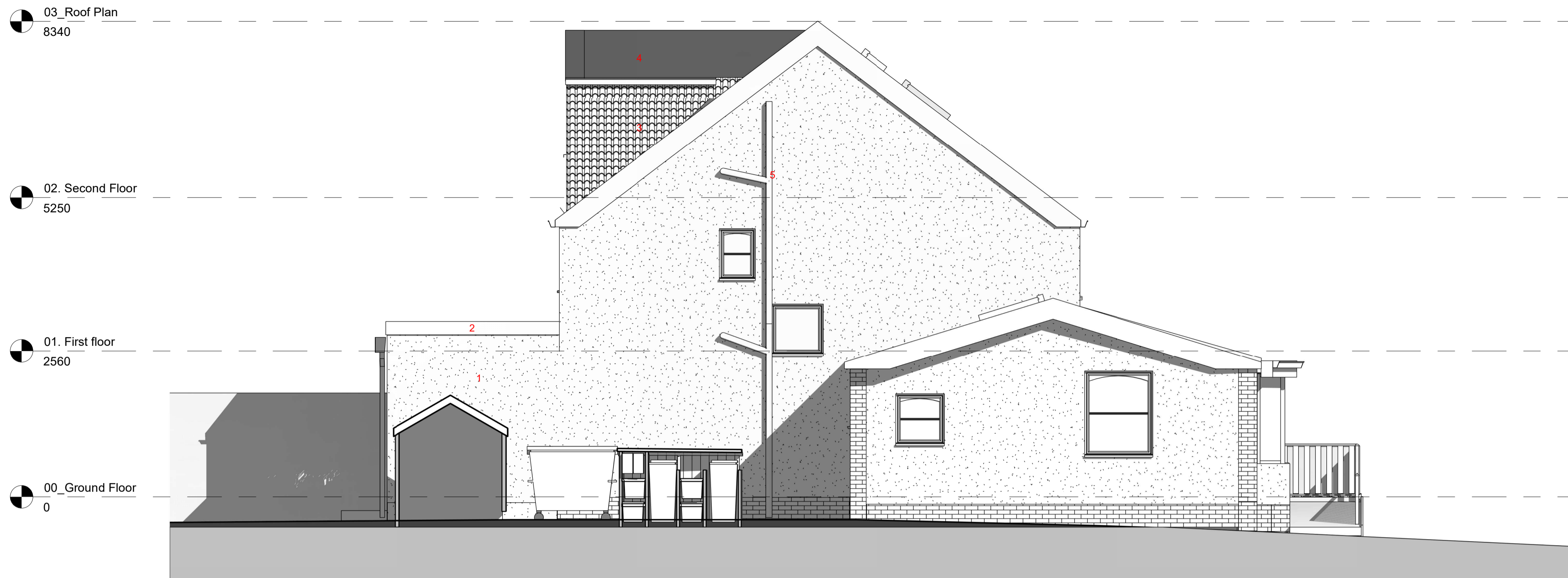
North Elevation (NW) 1 : 50 @A1 1:100 @A3