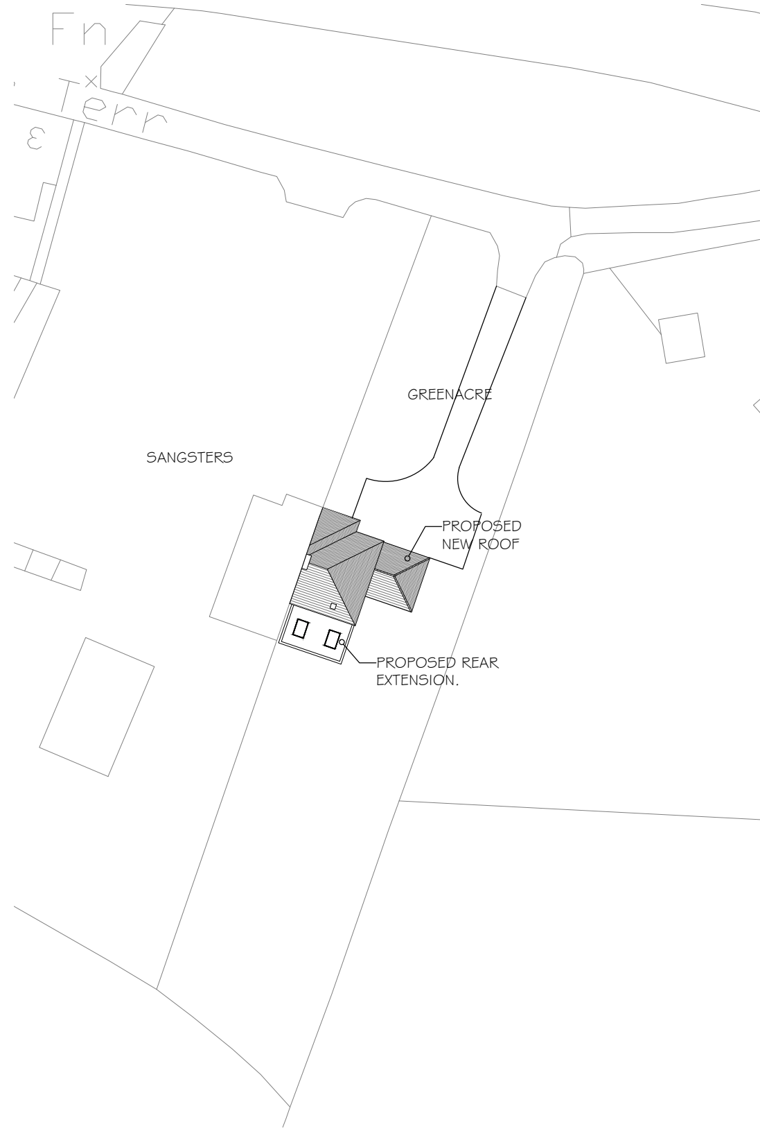
BLOCK PLAN (1:500)