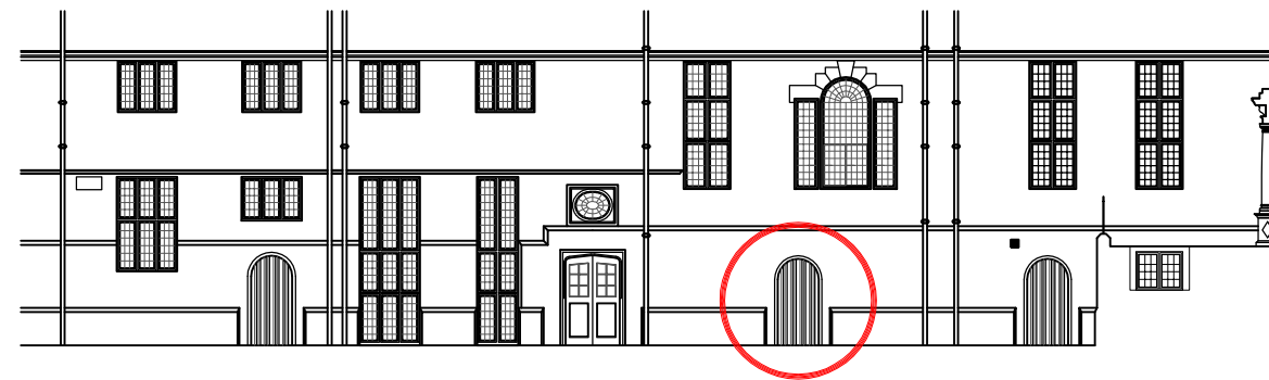
KEY (1:200 @ A3)

PLANNING ISSUE (AMENDED DISCHARGE CONDITION 4) TL 28/06/23