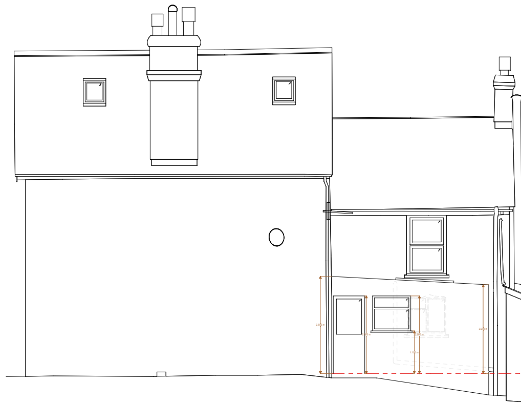
Proposed South Elevation 1:100

Please see the disclosed images as reference to the condition of the property at the time of survey.