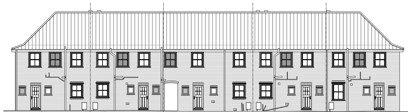
18 Sycamore Place 17 Sycamore Place 16 Sycamore Place 15 Sycamore Place 14 Sycamore Place REAR ELEVATION ELEVATION 3