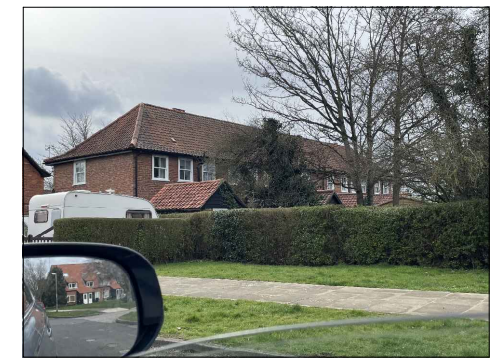
REAR / SIDE ELEVATION ELEVATION 4 18 SYCAMORE PLACE

BSB Architecture The Deep Business Centre Tower Street Kingston upon Hull - HU1 4BG Tel : 01482 329 276 Fax: 01482 213 602 Email: info.bsbarchitecture@gmail.com