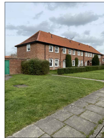
FRONT / SIDE ELEVATION ELEVATION 2 14 SYCAMORE PLACE