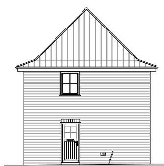
18 Sycamore Place SIDE ELEVATION ELEVATION 4