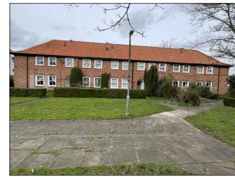
FRONT ELEVATION ELEVATION 1 14 - 18 SYCAMORE PLACE