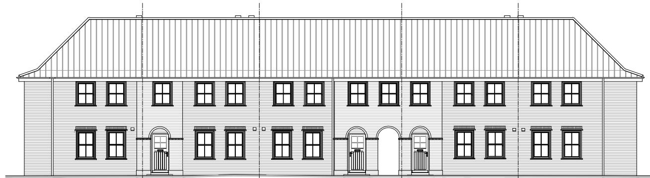
14 Sycamore Place 15 Sycamore Place 16 Sycamore Place 17 Sycamore Place 18 Sycamore Place FRONT ELEVATION ELEVATION 1