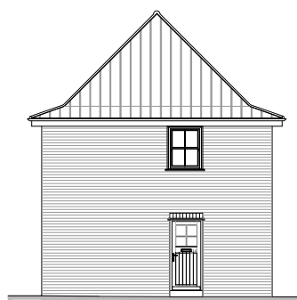
14 Sycamore Place SIDE ELEVATION ELEVATION 2