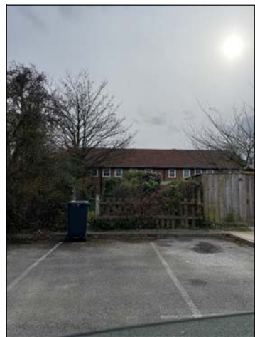
REAR ELEVATION ELEVATION 3 18 - 14 SYCAMORE PLACE