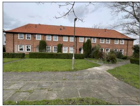
FRONT ELEVATION ELEVATION 1 14 - 18 SYCAMORE PLACE