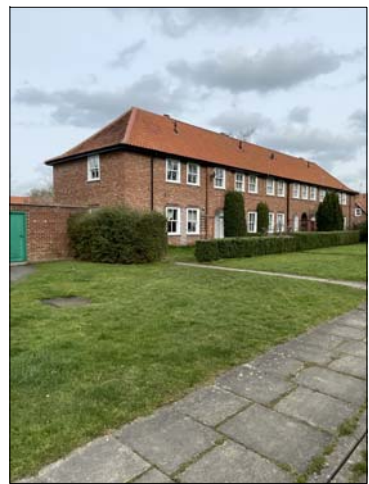
FRONT / SIDE ELEVATION ELEVATION 2 14 SYCAMORE PLACE