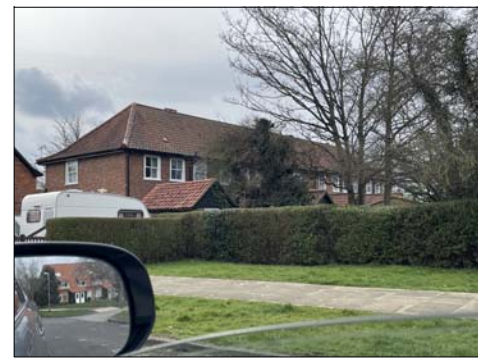
REAR / SIDE ELEVATION ELEVATION 4 18 SYCAMORE PLACE