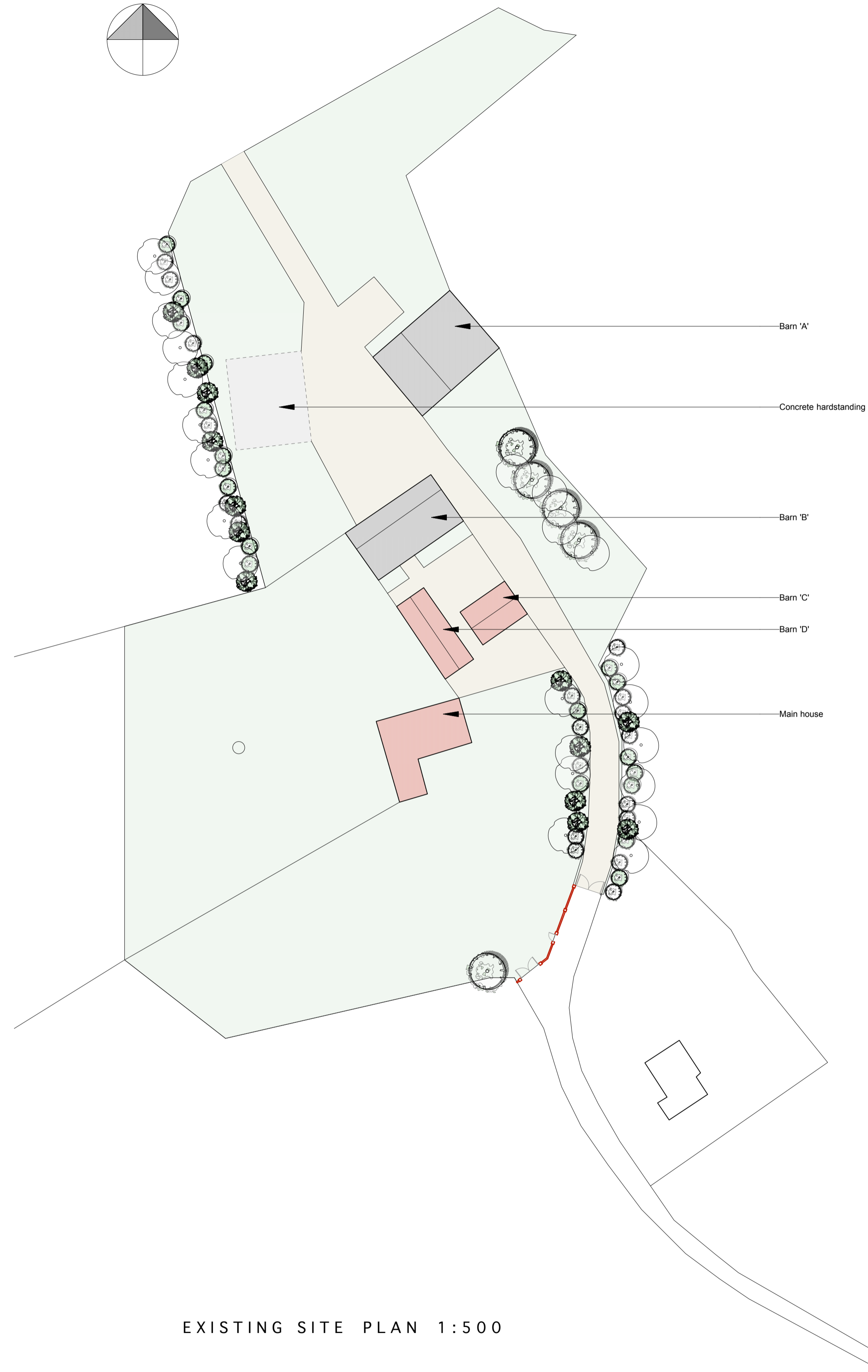
EXISTING SITE PLAN 1:500