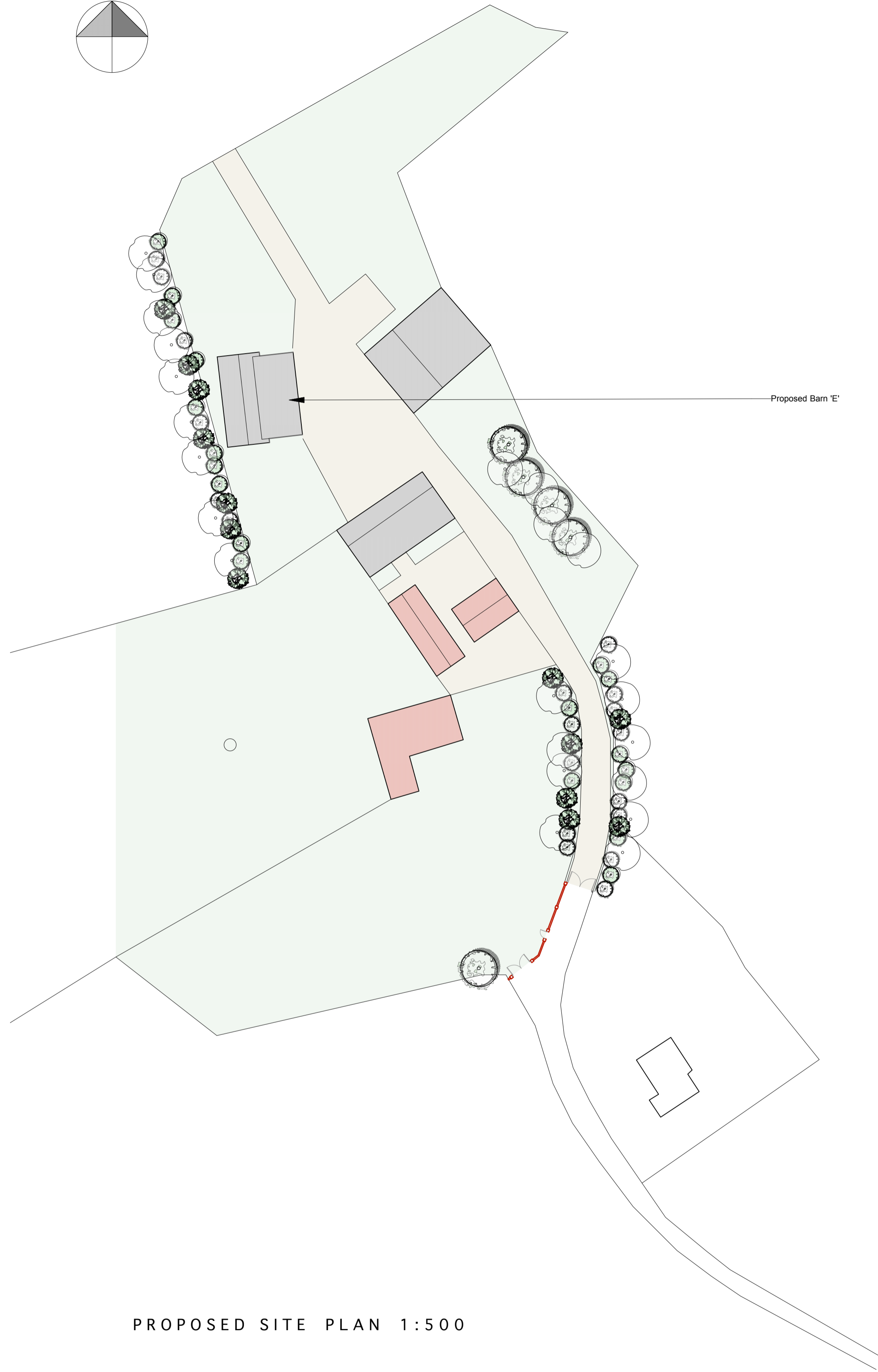
PROPOSED SITE PLAN 1:500