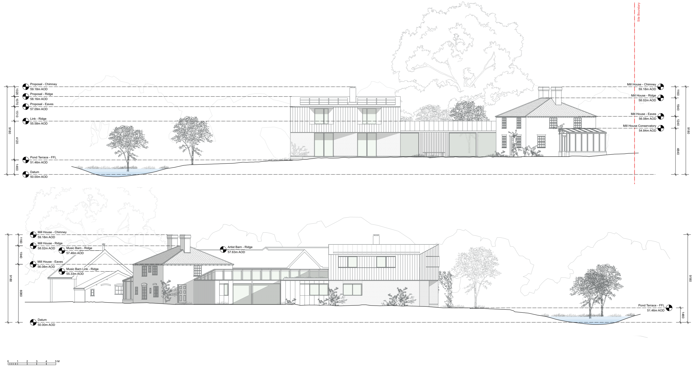
Above: Proposal elevations (@1:200)