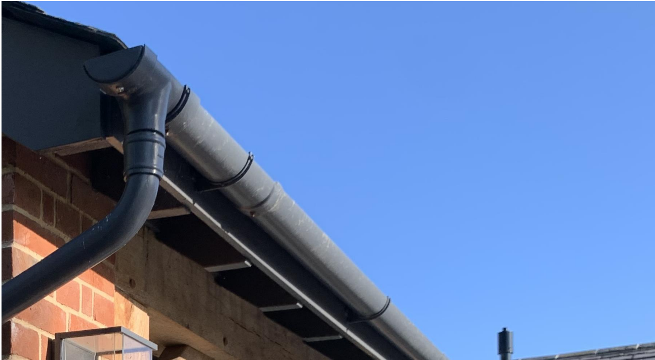
Images of existing rainwater goods.