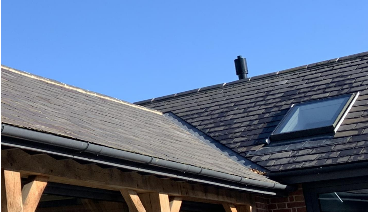
Image of existing rooflight.