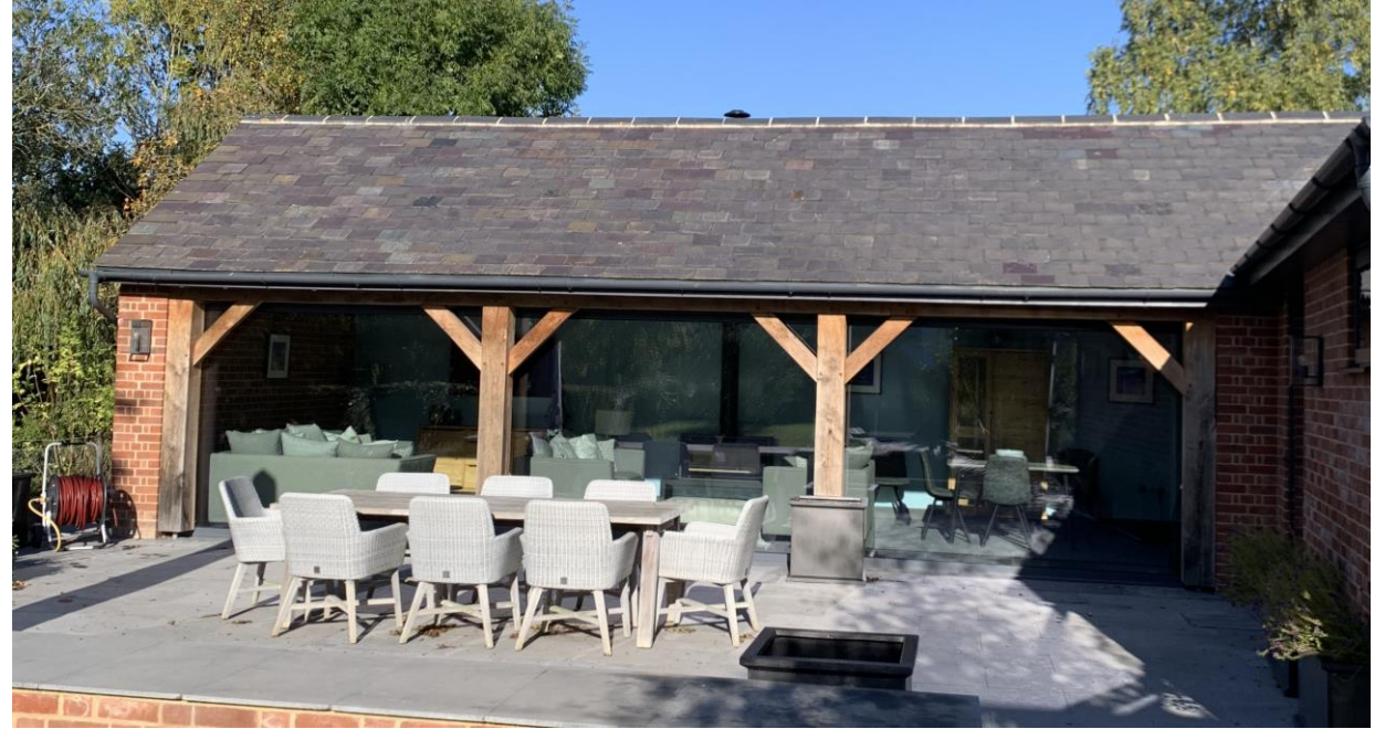
Images of existing slate roof tiles.